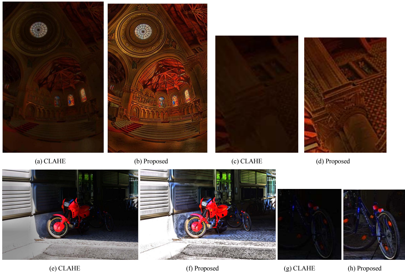
Figure 2. Comparison of images processed by the proposed method and CLAHE. Zoomed in views for highlighted regions are also shown.

contrast loss for enhancement. For better comprehension and a closer look, we have also shown in Fig. 2 (c), (d), (g) and (h) the zoomed in views of image portions. Observe that the proposed method renders better visibility of the contents as compared to CLAHE. Because in general the contrast was improved for each image content and all the TMOs used, the proposed idea is general and effective strategy for post processing of tone mapped images for better visual quality. In Fig. 2, we provided only two examples due to lack of space. However, the reader is encouraged to download other images from the website http://dl.perreira.net/more_examples.rar for more visual examples that demonstrate the effectiveness of the proposed scheme in comparison to CLAHE.