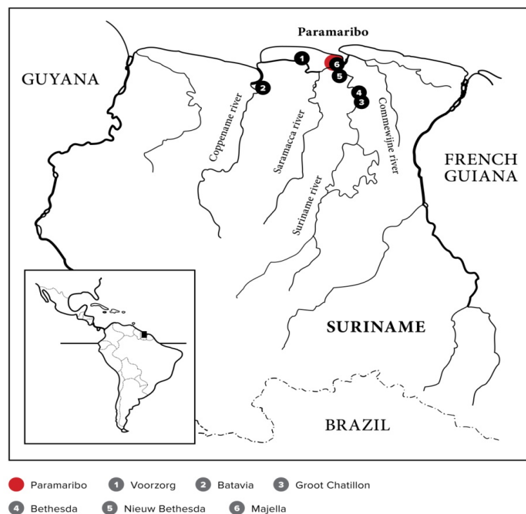
Figure 1. The six leprosy settlements in Suriname. This map is an adapted version of the original by Hendrik Rypkema, Naturalis Biodiversity Center, Leiden, the Netherlands.