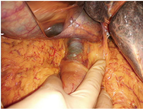
Figure 3 Dilatation of the main biliary tract.