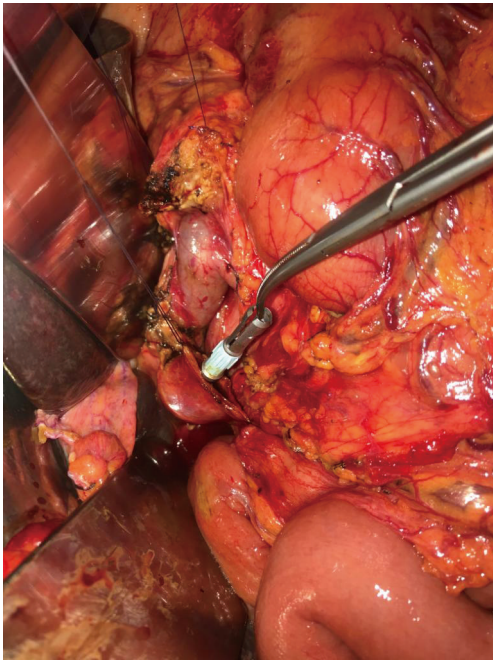
Figure 1 CEEA 21-mm stapler head placement.