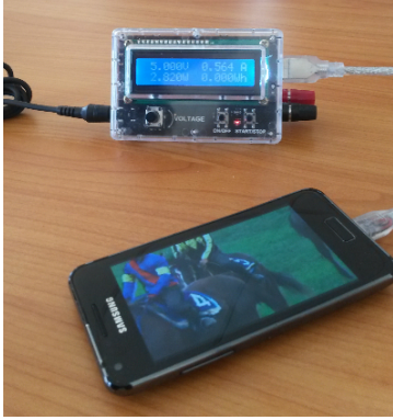
Fig. 2. Bench set-up

In this section, the demo test bench is depicted as well as the software set-up. The power consumption is measured with a ODR01D power meter device. It collects voltage, current and power of the system load. The measurements are performed at a sampling rate of 10 Hz. The Device Under Test (DUT) is directly connected to the power meter device supplying it as depicted in Fig. 2.