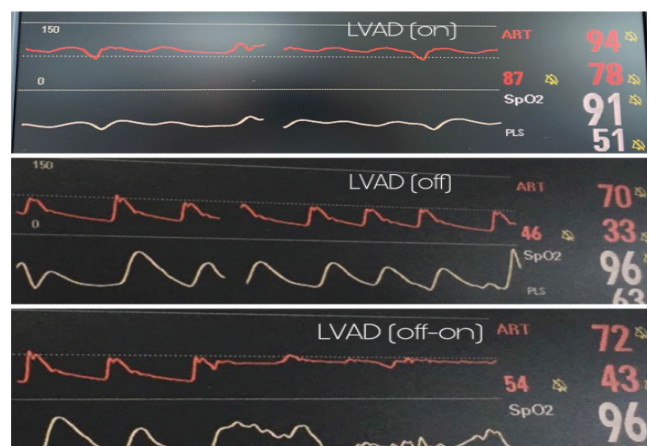
Fig.3 LVAD on-off-on

The hemodynamic were stable throughout the intervention. The debit of the LVAD pump was good, providing a satisfactory perfusion with an average