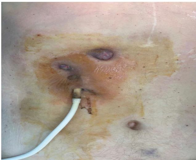
Fig.2. Infection on cable insertion

Initially with Ceftriaxone (IM) according to the antibiogram for positive culture against Staphylococcus spp in June 2019. In the following months the patient is presented again in hospital with positive wound culture for Pseudomonas aeruginosa . It is tried to be treated on an outpatient basis according to the antibiogram with Ciprofloxacin but no significant improvements were seen in the follow up. The patient is hospitalized and the culture is positive for Pseudomonas Aeruginosa .