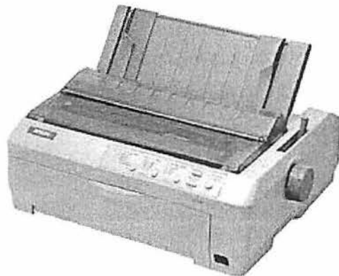
Figure 1.1 shows a type of dot matrix printer