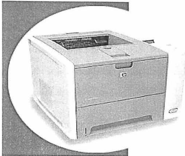
Figure 1.3 shows a typical laser printer

about 0.08 mm), and the dots overlap to give characters of a continuous appearance (Allen, 1987).