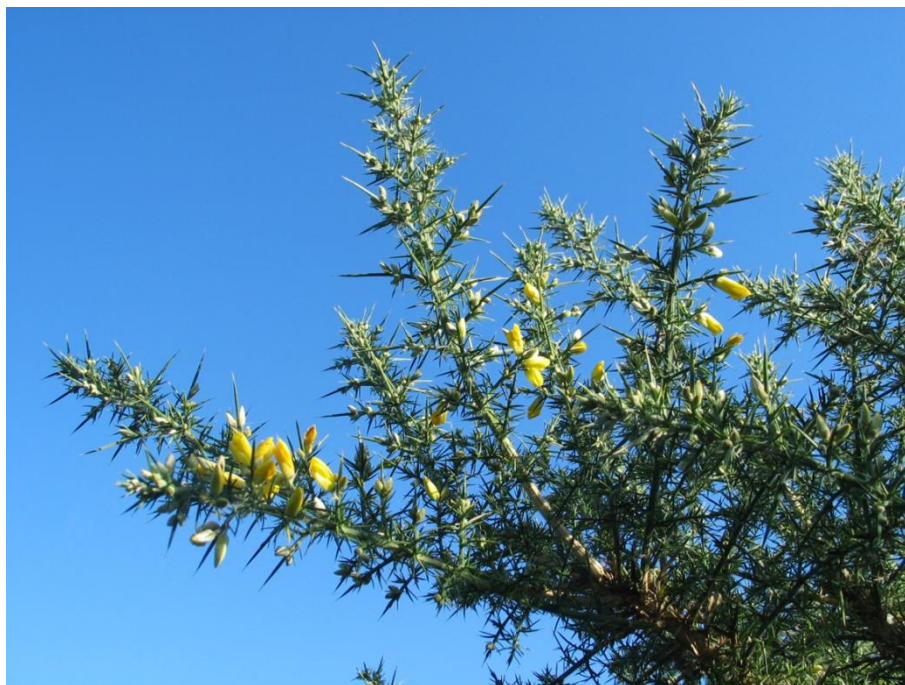
Figure 1.— Gorse ( Ulex europaeus ): a very thorny shrub (photo Atlan, 2008).

Ulex europaeus , the common gorse, also named furze but hereafter referred to as “gorse”, is a perennial, evergreen thorny shrub (Fig. 1). It is a nitrogen-fixing Fabaceae and is very high in protein. This pioneer species mainly occupies open environments on acidic soils. It reaches its adult height of 1 to 4 metres between the ages of 5 and 7 years. It is also a pyrophilous species: its presence contributes to fires because it is highly flammable, and seed germination is triggered by fire. Its flowering period lasts for a very long time (2 to 10 months) and one single plant can produce tens of thousands of seeds per year, and these seeds can remain viable for more than 20 years (Hill et al. , 2001).