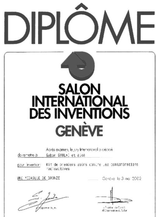
Picture 5. Geneva International Innovation Award