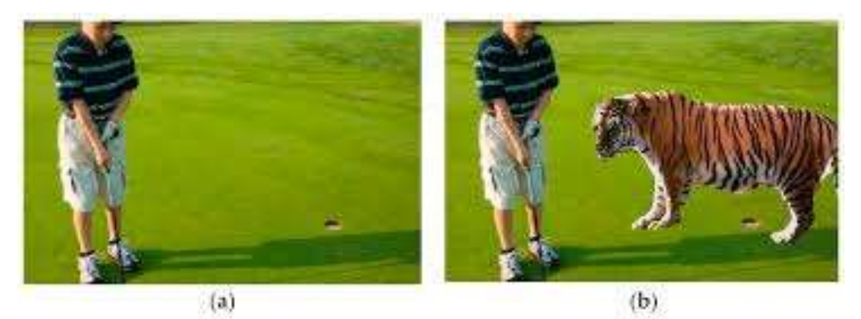
Figure 4: Splicing Method example. (a) original image. (b) spliced image.

Splicing method is a type of falsification process to create a single image by combining two or more images. This is also called image composition, where different operations of image processing are carried out, see figure 4.