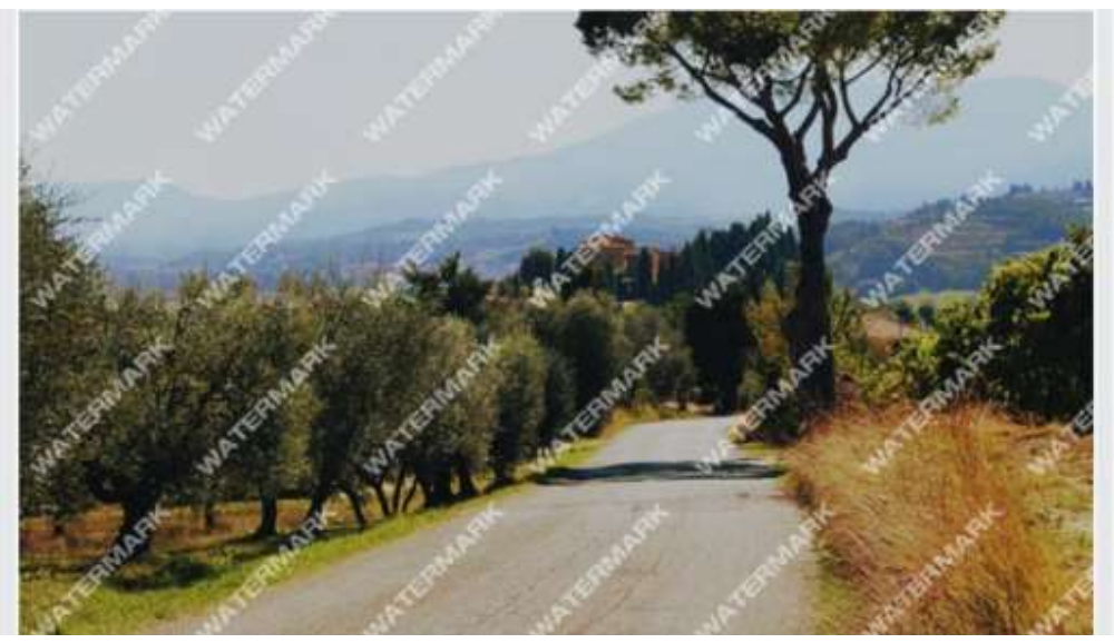
Figure 2: Digital Watermarking example

There are two types of the active methods that are digital watermarking and digital signature [2]. A digital watermark is added to the photo to identify copyright. It is the process of hiding special information (series of bits) in a digital image. The special information may be the author's serial number, company logo, meaningful text, and so on. Watermarks may be visible or inviable. Figure 2 shows an example of watermarking.