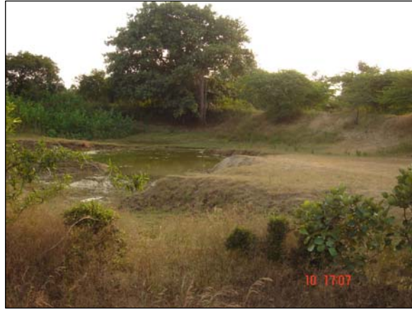
Picture 15. Percolation tanks constructed in Thoguta watershed, Medak district.