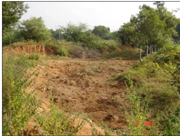
Picture 5. Filled up PT constructed on Gudikandula village cart road in Bussapur watershed