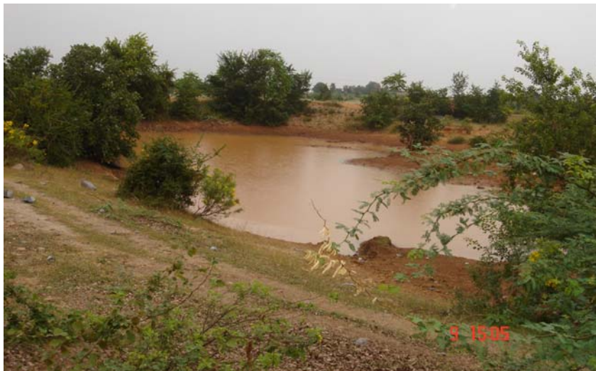
Picture 18. Stored water in a percolation tank in Velikatta watershed, Medak district.