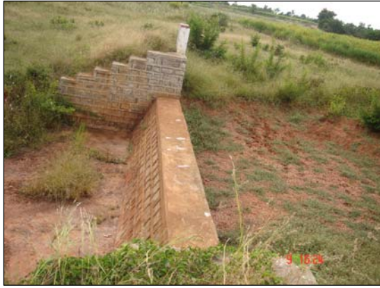
Picture 7. A masonry check dam in Duddeda watershed filled with silt.