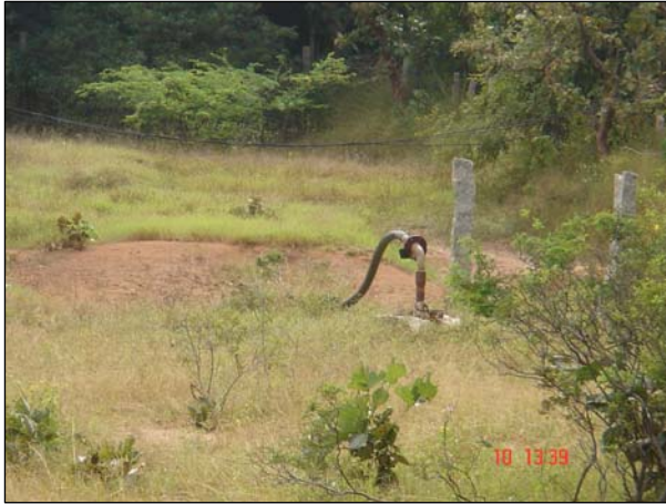
Picture 11. Percolation tank with bore well in Bakrichepyala and Nancharipally watershed, Medak district.