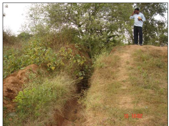
Picture 19. Condition of percolation tank (left) and drain made across the bund (right) to drain out water and to irrigate paddy fields down side in Yellareddypet watershed, Medak district.