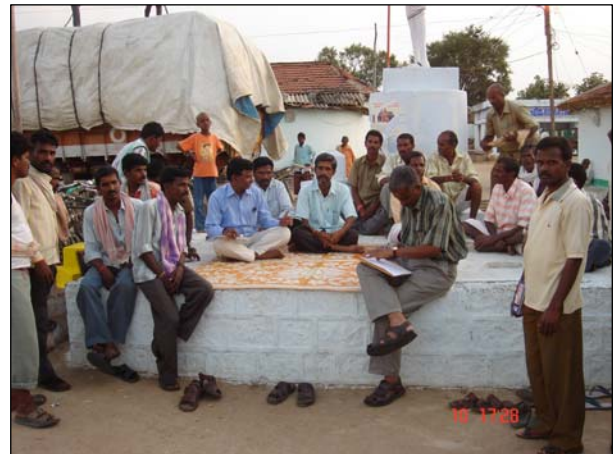
Picture 2. FGD in Thoguta village