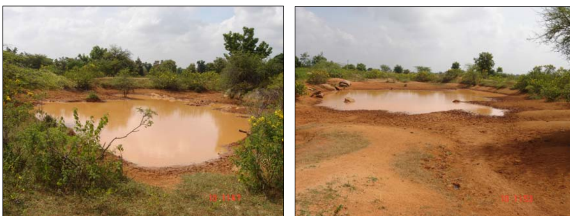
Picture 6. Percolation tanks constructed in uncultivated area in Chinna Gundavelly watershed