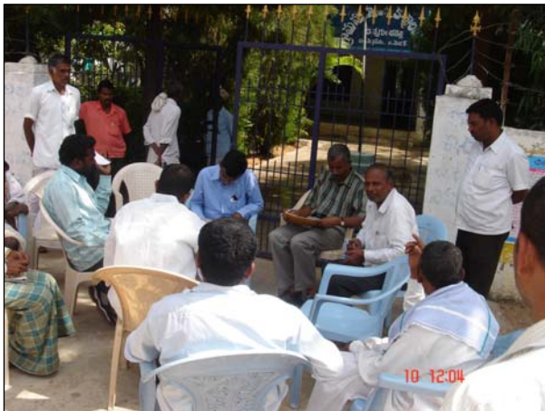
Picture 1. FGD in Chinna Gundavally village

The meetings also served as an opportunity to verify the records of the watershed development team where ever available and to discuss aspects such as maintenance of the structures, sustainability and other schemes implemented in the village.