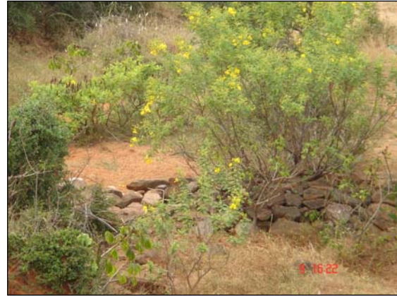
Picture 8. Partially damaged loose boulder structure in Duddeda watershed.