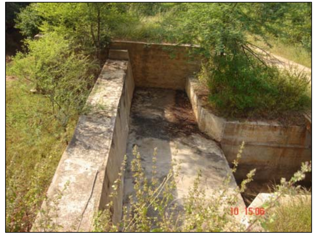
Picture 13. Masonry check dams constructed in the forest lands in Ponnala watershed.