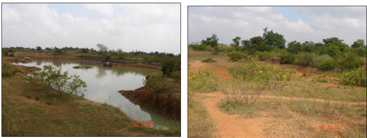
Picture 10. Percolation tanks constructed in the fallow land (left) and in the cultivated land (right) in the Irukodu watershed, Medak district.