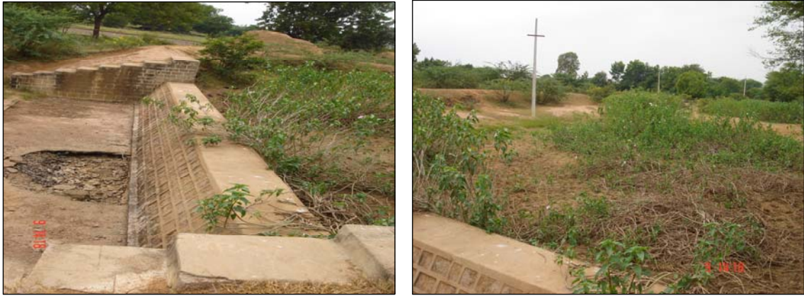
Picture 17. Damaged apron wall (left) and accumulated silt (right) in a check dam in Velikatta watershed, Medak district.