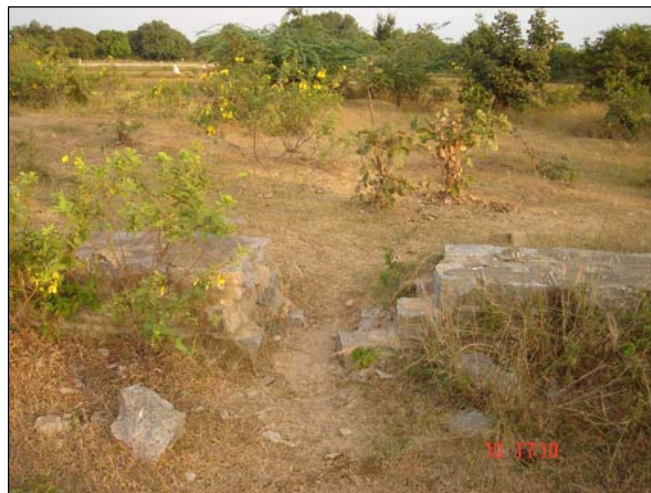
Picture 16. Damaged spill way of PT constructed in Thoguta watershed.