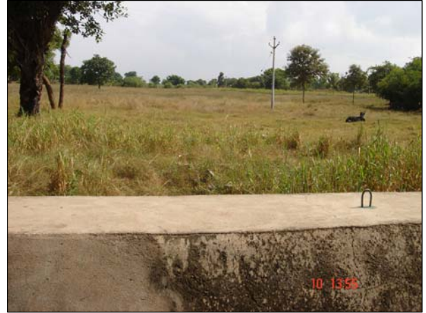
Picture 12. Masonry check dam constructed in plain land in Bakrichepyala and Nancharipally watershed.