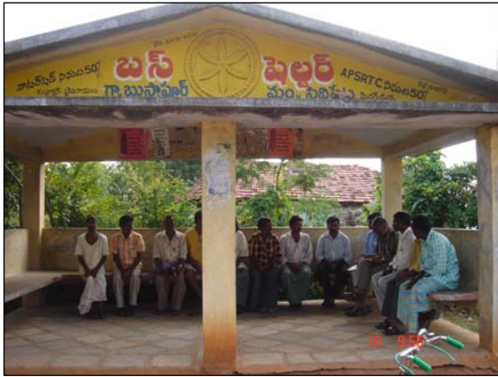
Picture 3. Constructed bus shelter under EPA in Bussapur village