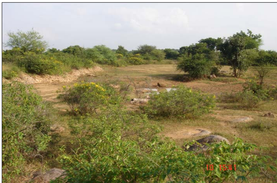
Picture 14. Percolation tank constructed in Tadkapally watershed, Medak district.