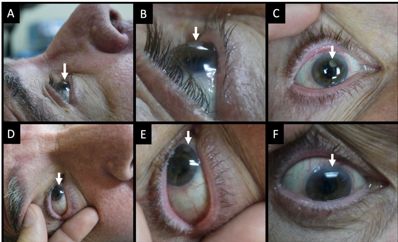
Fig. 2. Patient in supine position showing the free movement of the ointment in the anterior chamber.

A–B: Side pictures of the patient in supine position showing the ointment at the top of the anterior chamber touching the endothelium. B: High magnification of panel A. C: Frontal picture of the patient in supine position with gaze at primary position. D: When the patient is in supine position looking to the left, the ointment moves to the nasal side. E: High magnification of panel E, F: when the patient is in fowler position with gaze at primary position, the ointment moves to 12 o'clock. White arrows: ointment.