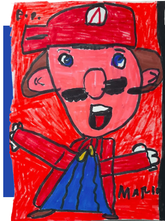
Super Mario (2022), Perriera, Wailuku, Hawai'i

Interested in being included in the next newsletter? Submit a request by the fourth Friday of each month at http://go.hawaii.edu/BJB .