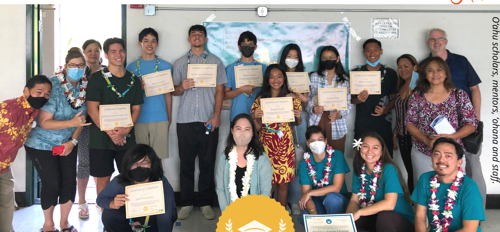
O'ahu scholars, mentors, 'ohana and staff.

END-OF-YEAR HŌ'IKE STUDENT PRESENTATIONS July 30, 2022