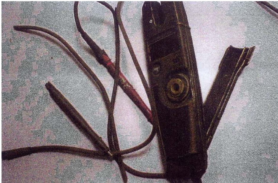
Figure 3. Bright yellow fluke multi-meter is badly blackened (burnt) as a result of measuring 4000 Volts.

Instead of hooking his meter leads between ground and one leg of the 3 phases to measure 2300 volts, our Master Electrician hooks his two meter leads across two different phases. This is a shortcut. By doing so, he can cut his testing time in half; if the voltage is proper, he can verify 2 phases with one measurement. But this is dangerous, if the voltage is unknown.