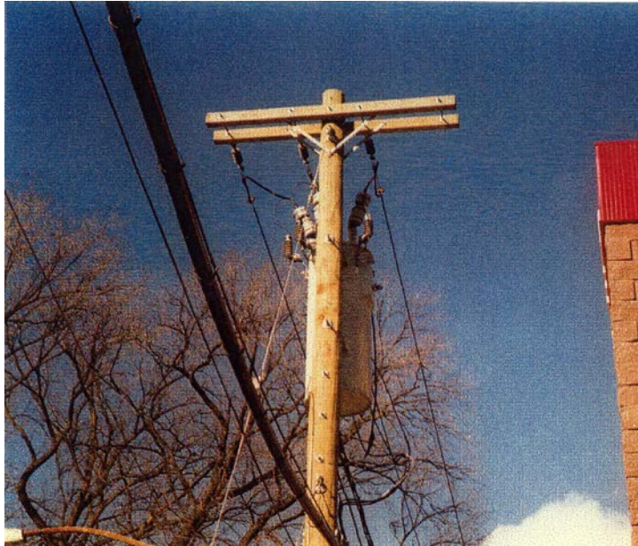
Figure 2. Telephone pole with 3-phase 13,000 Volt power cable near building (right) where accident occurred.