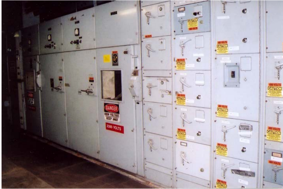
Figure 4. A sampling of the more than 300 electrical closets at a very large food warehouse in New Jersey.