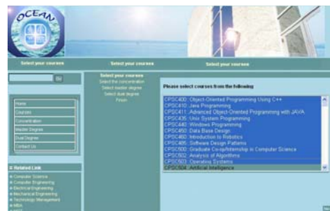
Figure 4. OCEAN Course selection page

After the selection of one of the provided options, the user is requested to select one or more of the preferred courses, concentrations, degrees and/or dual degrees. Fig. 4 depicts the list of current courses that are offered in the