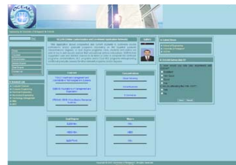
Figure 3. OCEAN Initial page

provides links to the course and concentration descriptions, and are altered randomly every time the page is reloaded (i.e., refreshed).