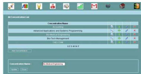
Figure 7. OCEAN Concentration selection page

OCEAN is developed using VB.NET 2005, ASP.NET 2.0, and MSSQLServer2000. This project is developed on a Pentium-4 based machine that runs Windows XP operating system, ASP.NET server, and Internet