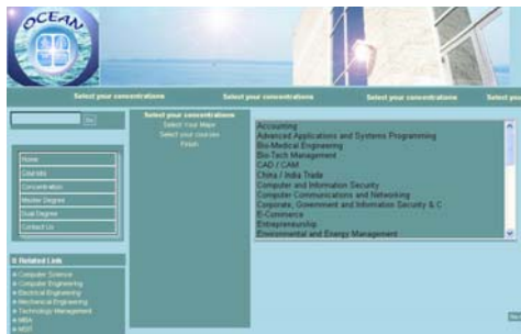
Figure 5. OCEAN Concentration selection page

In each of these consecutive steps of concentration, degree, and dual degree selection, the user may choose not to proceed further, and may skip the step (Fig. 5).