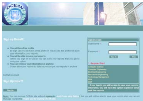
Figure 1. OCEAN Start up page

The Online Customization and Enrollment Application Network (OCEAN), developed in the School of Engineering at the University of Bridgeport is an interactive web-based application for graduate programs, concentrations, certificates and courses across the Schools of Engineering, Business and Education that allows prospective and current students to customize their preferences in the course selection process depending on