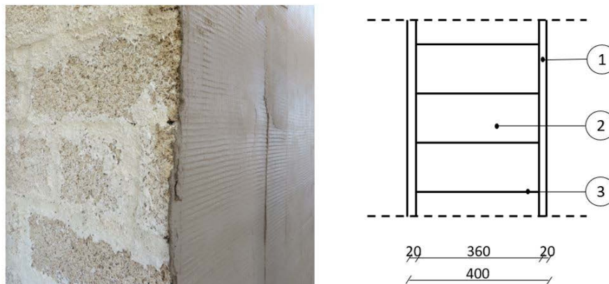
Figure 2. Wall system: 1-plaster (thickness: 20 mm); 2-hempcrete blocks (thickness: 360mm); 3-bedding mortar.

Currently, the data collected in the Sicilian campaign have been elaborated, the reference standards are UNI EN 15026:2008 and UNI EN ISO 13788:2013. The measurements have been performed on the South-West, South-East and North-West walls for 13 days (in August) during which the inhabitants were not present to exclude the influence of the air conditioning system. The wall system is 400mm thick (Figure 2): the hempcrete blocks have a thickness of 360 mm, the ratio between dolomitic lime and hemp shives is 3:1; the plaster is premixed, constituted by hydraulic lime NHL 5 and it has thickness of 20 mm both on the internal and on the external face of the walls. The bedding mortar is characterized by a dolomitic lime-to-hemp shive ratio of 3:1.