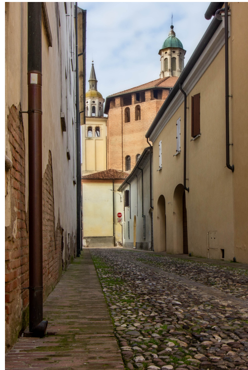
Figure 2. A street in Sabbioneta, site for the development of this research empirical investigation. The picture shows some features of the historical city that doesn't meet the minimum standard of accessibility, e.g. undersized pedestrian sidewalks and quality of the road material that prevent a safe crossing of the same.

The next step, here only introduced, aims to objectify those parameters through measurements and observations that arise directly from the pointclouds. This procedure allows to avoid errors in evaluations and, above all, to provide each element with objective numerical parameters. The research activity continues in different directions, thus reflecting the multidisciplinary aspect that characterizes it. On the one hand, it is to define the best algorithms for the segmentation and classification of the elements of the pointcloud. In particular, it is advisable to analyze the possibilities offered by artificial intelligence, even with the difficulties of working in many different environments, consisting of modern urban contexts, standardized and