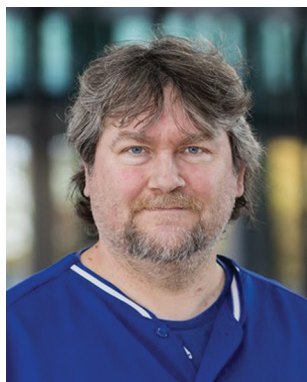
Michael G. Debije

The second camp, which we espouse, allows researchers to directly compare between LSCs employing different luminophores and architectures, and even LSCs employing additional components such as surface photonic layers or structural reflectors. In this approach, the performance of LSC is determined by the optical processes taking place in the device, with