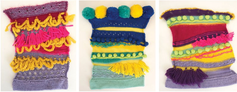
Figure 4. Knitted textile samples created for the ‘playful’ sessions.