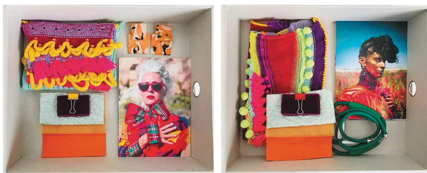
Figure 3. Two of the “playful” session boxes (Fleetwood-Smith et al. 2021).

objects, images and materials, which were presented to participants according to each theme. For example, the ‘playful’ session involved individual boxes to support personal engagement with items, whilst the ‘narrative’ sessions involved a curated table of items to promote shared interactions and discussions. Sessions were videorecorded to enable exploration of both verbal and embodied expressions (e.g. gestures, movements). Figure 3 shows an example box of objects, materials and images used in a ‘playful’ session.