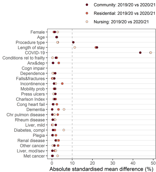
Figure 1 Assessment of similarity of the characteristics between people aged 65 or over (with or without a diagnosis of confirmed or suspected COVID-19) who were admitted to National Health Service hospitals in England for hip fracture before the pandemic (March 2019 - February 2020) or during the COVID-19 pandemic (March 2020 - February 2021), by patient residence. Age and Charlson Comorbidity Index were included as continuous variables. Rel = related, Anx&Dep = anxiety and depression, Cogn Impair = cognitive impairment, Mobility prob = mobility problems, Press ulcers = pressure ulcers, Cong heart fail = congestive heart failure, chr pulmon disease = chronic pulmonary disease, Rheum disease = rheumatological disease, Liver, mild = mild liver disease, Diabetes compl = diabetes with chronic complications, Plegia = hemiplegia or paraplegia, Liver mod/severe = moderate or severe liver disease, Met cancer = Metastatic cancer with solid tumour.

and resulting cause-specific HRs were compared with the initial model. We used R (V.4.0.3) for data processing and statistical analysis and SAS (V.7.12) for data cleaning and analysis of comorbidities. 42