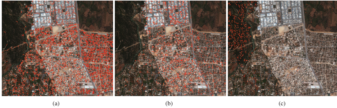
Fig. 2. Example substructures obtained by graph analysis. The regions that are involved in different substructure instances are shown in red in different subfigures.

erations allowed was 4,000. We ran the algorithm 1,400 times starting at different sets of randomly selected points. This resulted in 1,197 unique candidate modes. After mode merging and the elimination of the symmetric modes, the number of modes was reduced to 271.