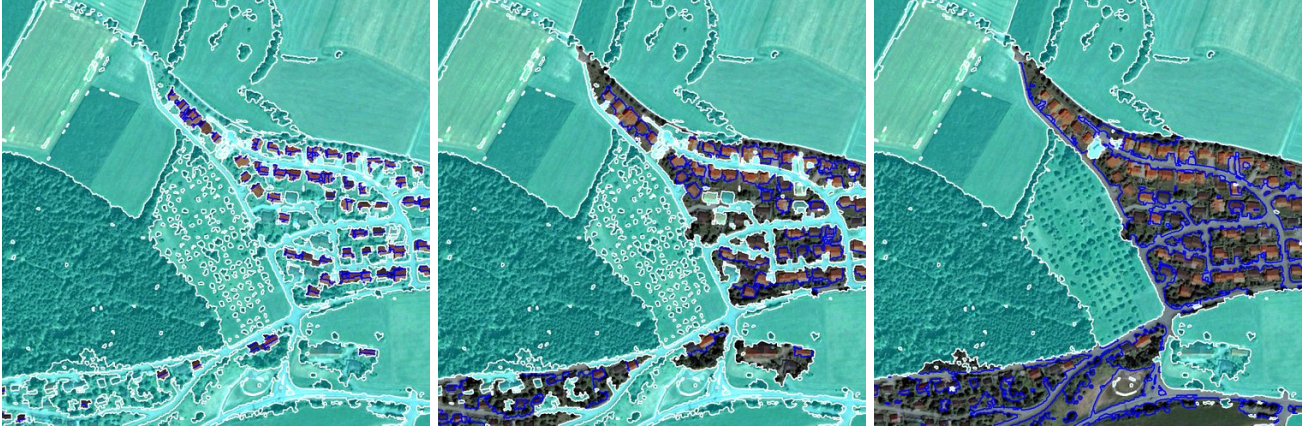
Figure 1. Clusters corresponding to the most significant transitions at levels 3, 4, and 6. The selected transitions are marked as blue, and the corresponding regions are highlighted.

selection of the regions that should be merged. The input to the algorithm is a segmentation together with its regions' features. Our aim is to find the significant neighborhoods in this segmentation. In this paper, we find the significant neighborhoods using the transition frequencies between neighboring regions. We assume that complex structures consist of region objects that appear together frequently. For example, the residential areas in a satellite image, that can be denoted as complex structures, consists of many building-grass and building-street neighborhoods.