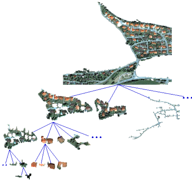
Figure 2. An example hierarchy.

to obtain each level in the hierarchy, feature extraction, neighboring region modeling, cluster selection, and region merging steps are performed iteratively. Figure 2 shows a part of an example hierarchy constructed by regions appearing in five levels.