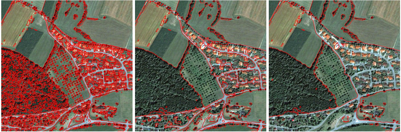
Figure 3. Hierarchy levels: 1, 5, 7.