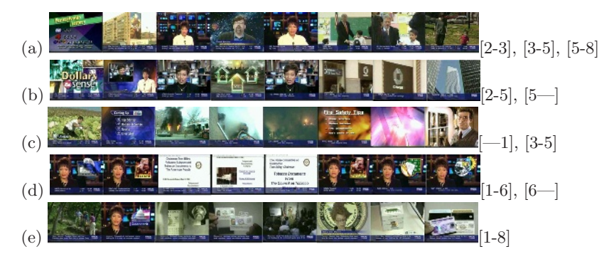
Fig. 2. Example story segmentation results. (The segment boundaries are shown as [<starting shot> - <ending shot>]. — is used to show that segment continues or starts outside of the selected shots.)

Other approaches that have been proposed for story segmentation are usually text-based. Integrated multimedia approaches have been shown to work well, however they incur great development and training costs, as a large variety of image, audio and text categories must be labeled and trained [2]. Informal analysis showed that our simple and cost-effective segmentation is sufficient for typical video retrieval queries [7].