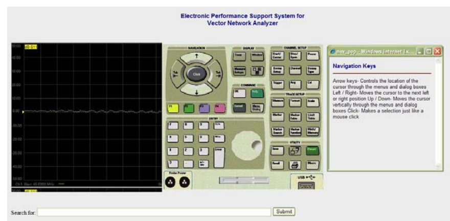
Figure 3: EPSS for ERRL (VNA Equipment)

EPSS structure of the ERRL project is developed on the pilot part of the project which is designed for Vector Network Analyzer (VNA) equipment of the laboratory. The EPSS can be reached from anywhere in the ERRL project. When the user needs something to learn about the VNA for example then clicks a link to be able to pass the EPSS part of the VNA. Figure 3 is showing the VNA help system. The real picture of the equipments is used in the user interface panel and screen. The right side is blank at the beginning. If the learner needs to learn something about the buttons then it is enough to click on the buttons to see the explanations of that button (See Figure 3, right part) .