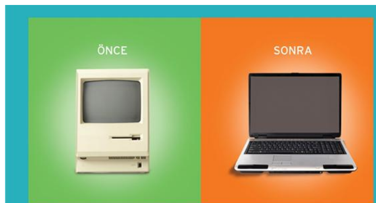
Figure 3: The Online Ad Promoting Arakibulaki.com

Some websites even encourage re-commoditization by offering consumers rewards and promotions for using their channels to dispose of their objects. An online sales website called “arakibulaki.com” announced a few years back that it was going to reward the first 14 people with the highest number of advertisements to sell their items. Their ad (Figure 3) displays an old fashioned PC as “before” and a new laptop as “after”. The ad encourages disposing by highlighting the rewards and opportunities of “getting rid of” the old stuff.