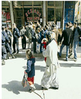
Figure 2 (a) The Karabayır district during the street fight, (b) a typical woman pedestrian in the Karabayır district where Siirtans reside

“undeveloped” societies, empower religious Siirtans and place them at a big advantage vis-a-vis Alevi Romans in the neighborhood. Thus, while some groups become upwardly mobile and politically powerful because of their ties with political actors, some others are left out. And this breeds violence. Furthermore, the State oppression exercised on some groups may lead them to resort to radical actions and political violence in their attempts to gain visibility and power. For example, there are some radical leftist groups in the wider Esenler area, which oppose to the State (“political violence”), and they try to protest the State, for example, through inward-oriented violence, i.e. death fasting. And periodically, they become victims of State violence, pushed into a relatively powerless and marginal position. Additionally, the State’s support of some groups may encourage them to use violence in order to suppress opposing groups. For example, Romans claim that the support of the local police for Siirtans encourages them to use violence against Romans.