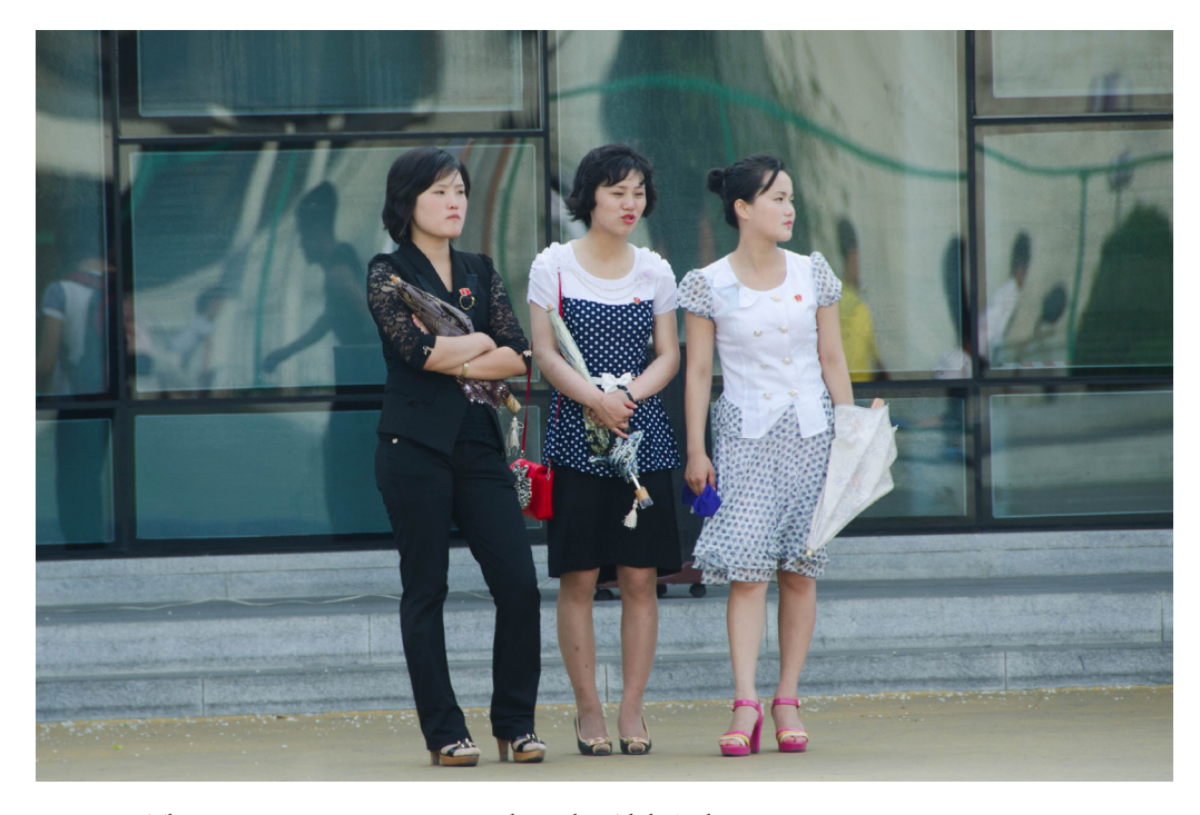
Figure 3: Three women in Pyongyang

[Wealthy people] wear more expensive clothes than ordinary people. And their children, too. And they buy expensive clothes for their parents, as well. So we know if someone is wealthy if they wear the trendy, padded winter clothes. We know if someone is rich if their parents, for example, wear furs, which can cost as much as 4 million won. Those furs are imported from China. If their parents wear expensive clothes, we know that that particular family has some money to spare. (Hahm, 42, interviewed in Seoul on 25 September 2014)