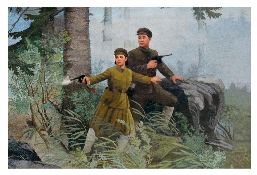
Figure 2: Detail of a painting at the Grand Peoples Study House showing Madame Kim Jong Suk with Kim Il Sung fighting the Japanese

Since Kim Jong-un's assumption of power after his father Kim Jong-il's sudden death in 2012, the further expansion of the market system has led to changes in women's values. As more women worked in markets, they started to build an interest in female beauty and to express themselves with a stronger sense of self and personal identity, through fashion and appearance. Fashion and beauty came to be seen as an expression of individuality, a notion of capitalism gaining an increasing hold in North Korea (Dalton et al. 2018).