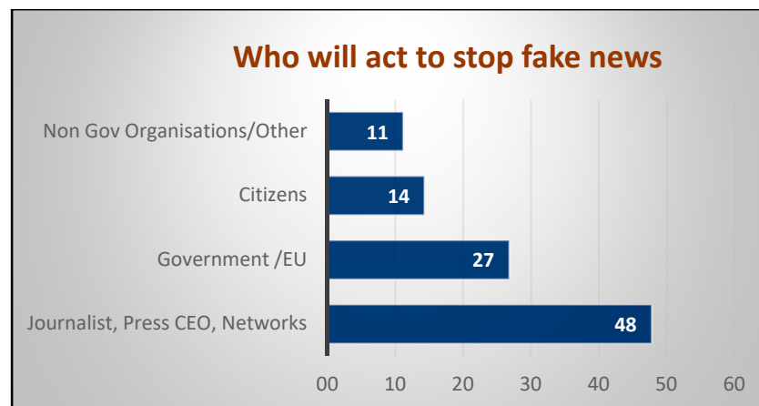
Figure 2. Who will stop fake news? (EU 2018).

In a 2018 a survey about vaccines with 28,782 respondents across the 28 EU member states, the perception towards vaccines was positive, with agreement (strongly or tend to agree) at 90%, safety at 82.8%, effectiveness at 87.8%, and compatible with religious beliefs at 78.5% [15]. The importance of vaccination was found to be related to the disease.