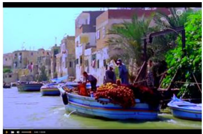
Figure 6. Still shots from Bolteya El-Ayema . Notes: On the left, the main character is standing on the ruins of her demolished house; on the right, it’s a depiction of daily life using the canals.