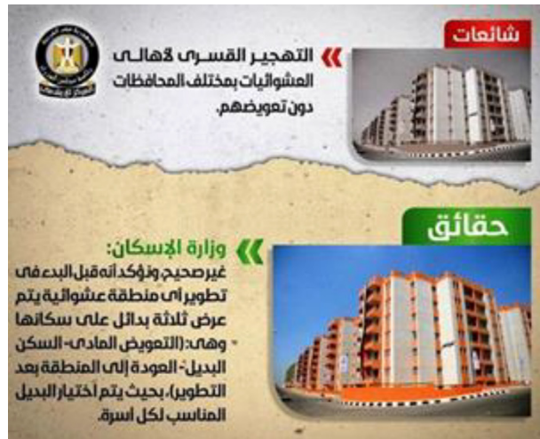
Figure 3. Official announcements to respond to rumors regarding Al-Asmarat through online channels. Note: translation—“The rumor: Forced eviction for ashwa’eyat residents without compensation. Facts: Ministry of Housing: Not true, as we confirm that before developing any ashwa’eyat area, three alternatives are offered—financial compensation, alternative housing, returning to the area after development—and the appropriate alternative is chosen for each family.”