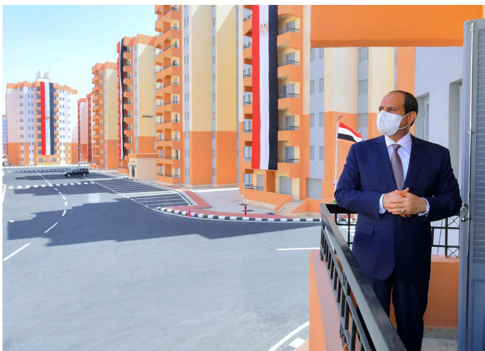
Figure 1. Media coverage for the inauguration of Al-Asmarat.

Values such as decency and cleanliness found in the new environment are promoted through sentences such as, "The new generations will grow up in decent places and not see what we have seen or what our parents have