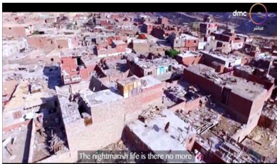
Figure 2. Still image from Man Ahyaha .

An exploratory review of the Facebook pages reveals contradictory opinions about life in Al-Asmarat. Comments reflect the same pattern as that detected in official media. One party praises the advantages of the new life granted to the ex-slum dwellers, advocating the efforts to improve the living conditions of thousands of people. The other party uses social media as a channel to vent anger, discussing their bitter dissension and disclosing their indignation towards the project, as can be seen in Figure 4.