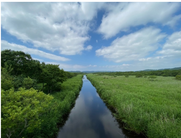
Figure 2 A typical scene of a wetland in eastern Hokkaido. In this region, the diploid haskap plants are found.