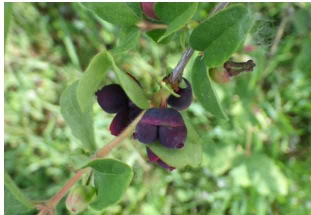
Figure 3 The fruit of interspecific hybrid between Miyama-uguisukagura and haskap. The fruit shows intermediate characteristics between Miyama-uguisukagura and haskap.

Regarding the amount of pigment, the interspecific hybrids tended to be intermediate between the parents.