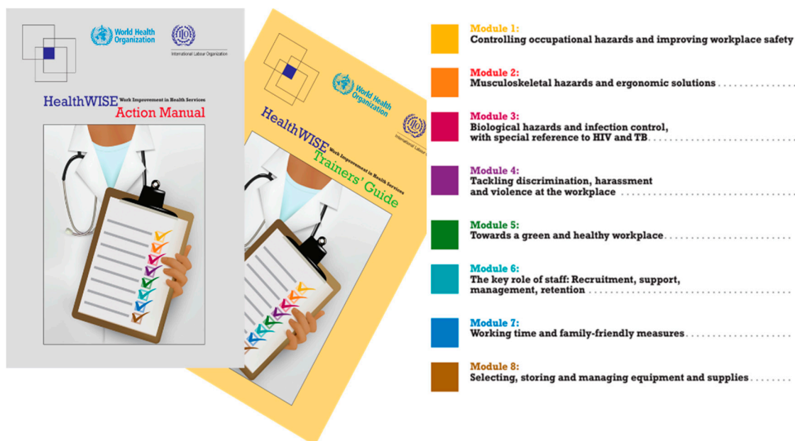
Figure 1. HealthWISE workbooks—the Action Manual and Trainers’ Guide—and a list of the eight modules that cover key areas of occupational health and safety (OHS) for health workers (HWs).

International organizations have developed tools to improve the occupational health and safety (OHS) of HWs. One of these is HealthWISE, a participatory, quality improvement tool, jointly developed by the International Labour Organization (ILO) and the World Health Organization (WHO) [4]. In 2010, a tripartite group consisting of workers’, employers’, and governments’ representatives, as well as specialists from the ILO and WHO, convened and agreed on a framework for improving the OHS of HWs. Based on principles from the original Work Improvement in Small Enterprises (WISE) training program created by the ILO, HealthWISE was then developed to help support the implementation of this framework [4]. HealthWISE aims to improve working conditions, performance, and workplace safety through training and empowering HWs with the ability to identify workplace hazards and areas requiring improvement in their work environments and to conduct processes for developing and implementing low-cost solutions to address them. HealthWISE consists of two workbooks, one for participants and one for trainers, with content organized into eight modules (Figure 1). The workbooks are available online in five languages. As with addressing the supply of HWs, the availability of the tool is only part of the solution. It is also important to understand the implementation of HealthWISE and to improve upon implementation processes to maximize the tool’s potential.