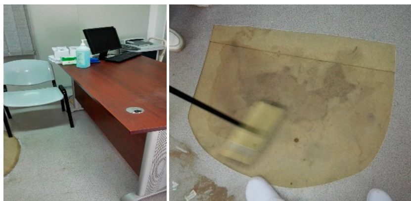
Figure 3. Before (not shown), the physician’s desk was positioned next to the window, with the patient to their right. After, the patient is positioned next to the window and the physician is seated on the opposite side of the desk, allowing the air to flow from the door outside. Ripped flooring has been removed.

“Human resources” were a barrier mentioned by all hospitals except A and C in Mozambique. All hospitals seemed to experience some degree of staff shortages, “when the departments are so short-staffed, they are reluctant to take part in some of the activities and to attend some of the meetings” (Hospital E, Focus group); turnover, “staff movement, some people are exiting the system, others might be on night duty, you know, on leave” (Hospital D, Focus group); overwhelming “workload from the department” (Hospital D, Focus group); and lack of time, “we always have quite demanding tasks that we do every day, our jobs are quite demanding, so the lack of time maybe is one of the major barriers to the implementation” (Hospital F, Focus group).