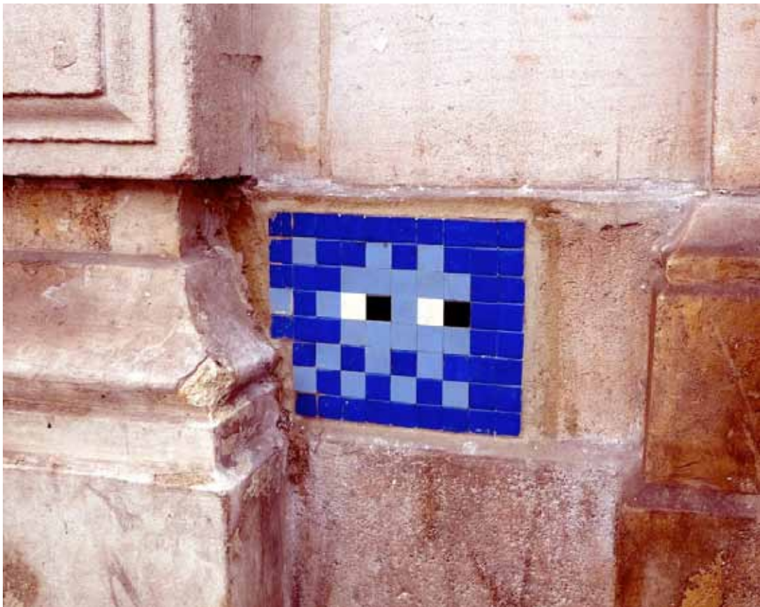
Figure 7 Invader, Space Invader , cemented mosaic, location unknown.

The figure of 38 invaded cities represents the artist's 2008 count, and a 2012 site tallies an estimated 77 cities with more than 3000 artworks (Street-artist de la semaine 2012). Invader's latest wave seems to have taken place in Hong Kong and a February 2014 entry on the Cheers from Space site reads: "I'm just back from Hong Kong where I have installed 48 new pieces in the city. Total score: 74 Pieces / 2180 Points" (Cheers from Space 2014). The score for a 'wave' (a series of sites invaded in a city in one trip), is tallied by adding the score for each invasion, which ranges from 10 to 50, depending on the size and nature of the image, as well as logistical difficulties encountered. In 2009 his Paris invasions stood at more than four hundred (Peiter 2009: 32), and in 2011, one thousand (Space Invaders 2011). It is hard to keep track however, as the artist says he has seen photographs of 'his' work from cities he has never been to (Space Invaders 2008). This emulation doesn't overly perturb him though, as it increases the 'viral' aspect of his praxis. The artist regards himself as a space hacker, which calls to mind the playful aspect of digital transgression: that often (non-malicious) hackers hack simply because they can.