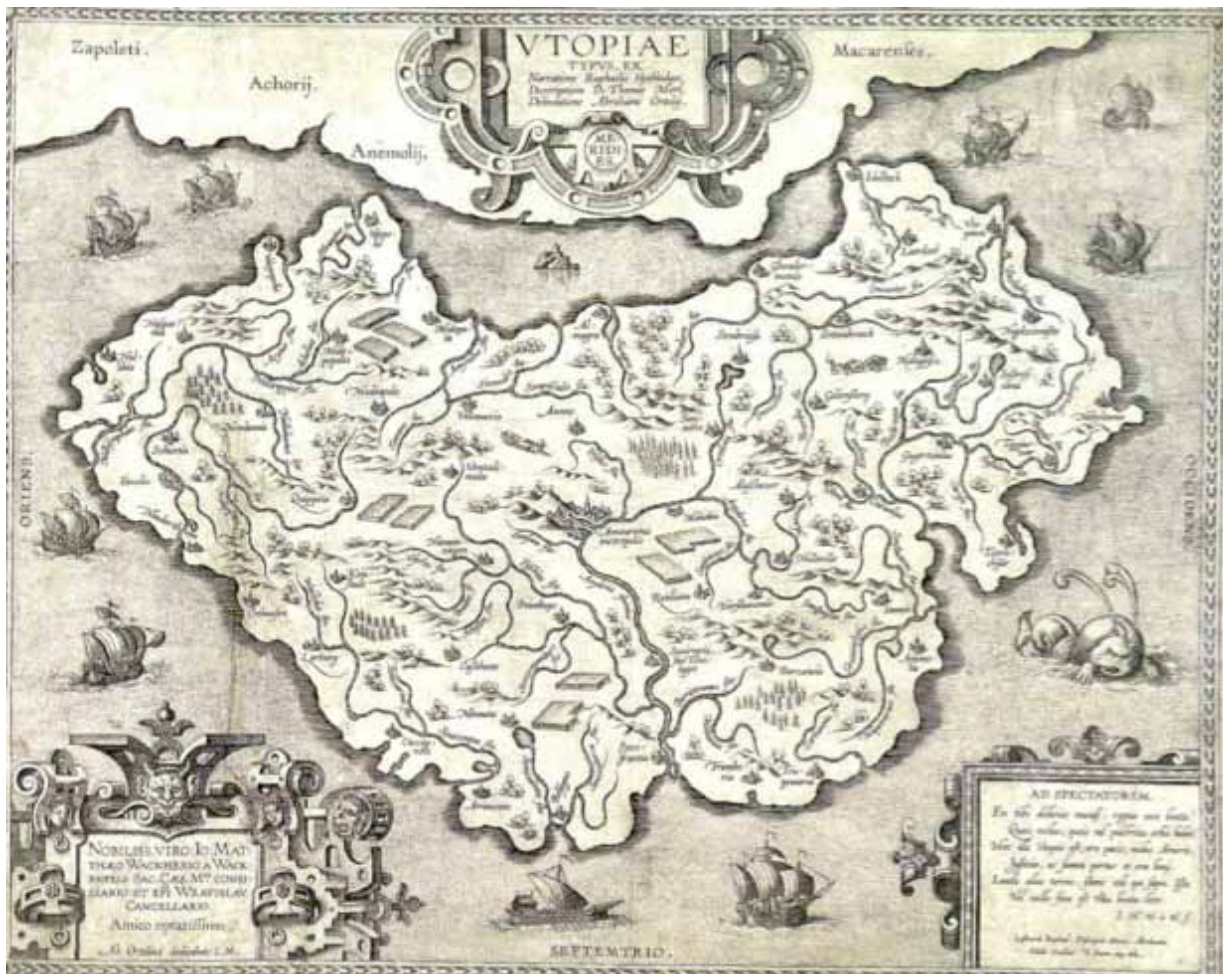
Figure 3 Artist unknown, illustration of Sir Thomas More’s Utopia . (source: Two men enter 2012).

to embody order, stability and rationality, but it is arguably the inescapable presence of the opposite of these ideals that compels the City to identify carriers of these undesirable iniquities, and then exclude them. The City itself becomes a Wall, or barrier, and exists as “an ideal field of containment or cordon sanitaire 3 ... [which] diagnoses and prescribes in an attempt to spatially contain, control, and if possible expel that which it judges to be pathological” (Nichols 2008: 460). This execrable aspect of the City which is constantly yet unsuccessfully in the process of being expelled coalesces as an “urban artefact that is both estranged from the city and at the heart of it” (Nichols 2008: 468), or, the Lacanian extimate – that which is simultaneously exterior and intimate, an internal shadow.