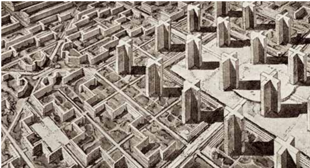
Figure 4 Le Corbusier, aerial view of La Ville Contemporaine.

All of the development driven utopias in Baltimore, and every global City, coalesce in the meta-construct described by Harvey as degenerate utopia. Degenerate utopias (a term formulated by