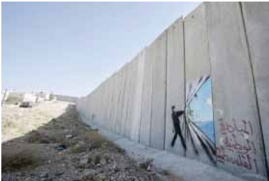
Figure 10 Banksy. West bank Wall, Ramallah, Palestine (source: The Real Sasha 2011).

would otherwise be blissfully unaware of the malpractices perpetrated on the ‘other’ side of the world in the name of state security. In an article on dissident art on the West Bank Wall, Parsberg (2006) notes Giorgio Agamben’s observations in State of exception (2005): “To show law in its non-relation to life and life in its non-relation to law means to open a space between them for human action, which once claimed for itself the name of ‘politics’”. The deed of showing the effects of a utopia of order on the lived experience of those not sanctioned by its system, is a political act which opens up a space of contestation. The act draws aside the veil of illusion regarding the level of (un)commonality in a commonwealth, the lack of actually manifested democracy in a neoliberal world order. In the words of Dan Frodsham (2012: 88), Banksy is rehabilitating utopia, “harness[ing] [utopia’s] potential as a dynamic mechanism for radical social transformation”. Banksy’s artistic practice “relocates the ‘no-place’ of utopia in the midst of the here and now ... thus creating incongruity within the same space”, and in doing so, instigates “a critical dialectic between virtual and real” Frodsham (2012: 88), or, with reference to the praxis described here, between the utopia of the City, and that of the city.