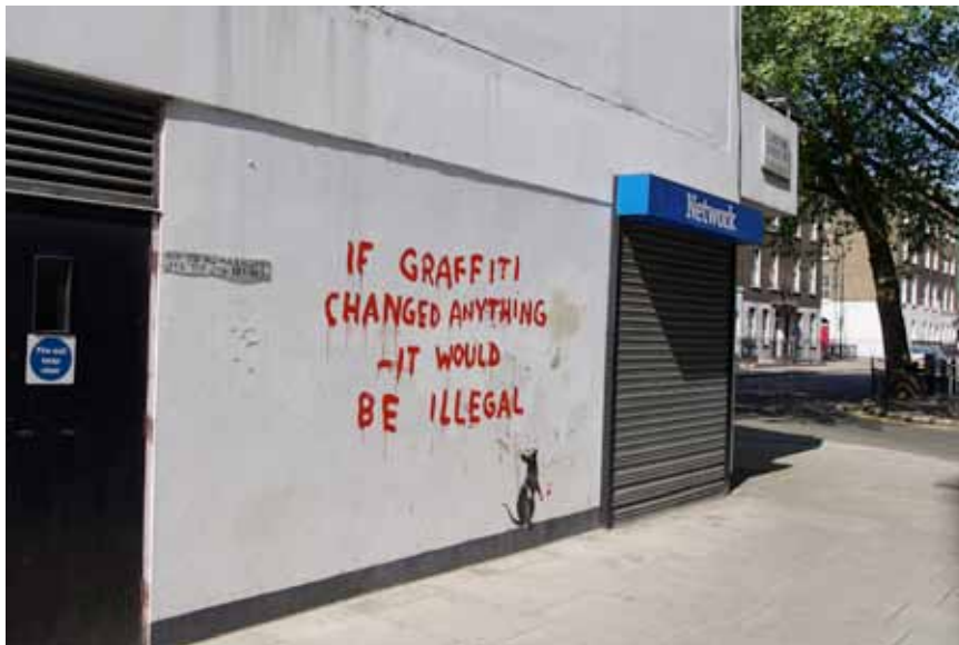
Figure 5 Banksy, If graffiti changed anything it would be illegal , London, corner of Clipstone and Cleveland streets, 2011.

It must be sanctioned, if you will, as transgressive by those ... considered to be within the law. It has to be disapproved . As writing [graffiti] it hurts : it is the outlaw’s expression of the pain of exclusion and dispossession, and it wounds what is ‘in law’. Ultimately the act is, as John Berger says of the misunderstood terrorist ... ‘a way of making sense of, and thus transcending despair’” (original emphasis).