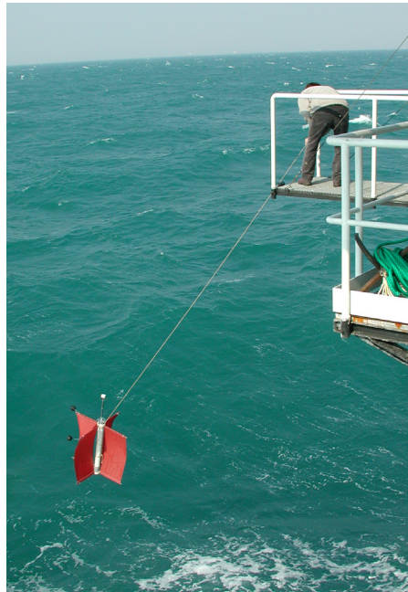
Fig. 1. Prototype CODE drifter being deployed from the “Acqua Alta” oceanographic tower on 4 April 2002 in wind speeds of about 15 m/s and with significant wave heights of 1.4 m.

integral time scale are considered. A total of 100 ensembles (or realizations) of more than 120 drifter tracks integrated up to 150 days have been produced.