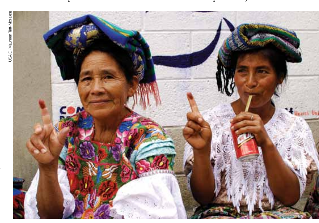
K'iche'maya women show inked fingers after voting in Guatemala

Different from the example of Ecuador, Bolivia, and other countries where Indian activism emerged from civilian popular and union movements, "in Peru, the pro-indigenous movement that would have the greatest impact had military roots, bases and ideology." That ethnocacerism appealed largely to low-ranking personnel with the military and police suggested not only the ethnic glass ceiling that is an unwritten rule in those institutions, but also the inability of Peru's national defense and public safety institutions