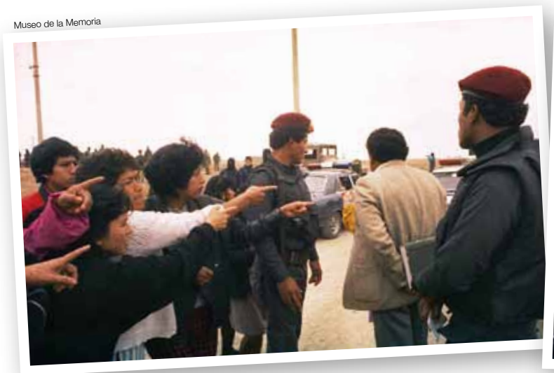
Residents of Villa el Salvador, Peru, point to suspected member of Sendero Luminoso, September 1992

instability is most likely. In addition, against shibboleths about the military as a catalyst for modernization and the creation of primary group identities around the nation-state, this emerging literature may fill in the blanks about the enduring appeal and relevance of ethnicity. Perceptions of a nation-state elite, and who they are, can be key in determining military-ethnic relations. As Enloe shows, the