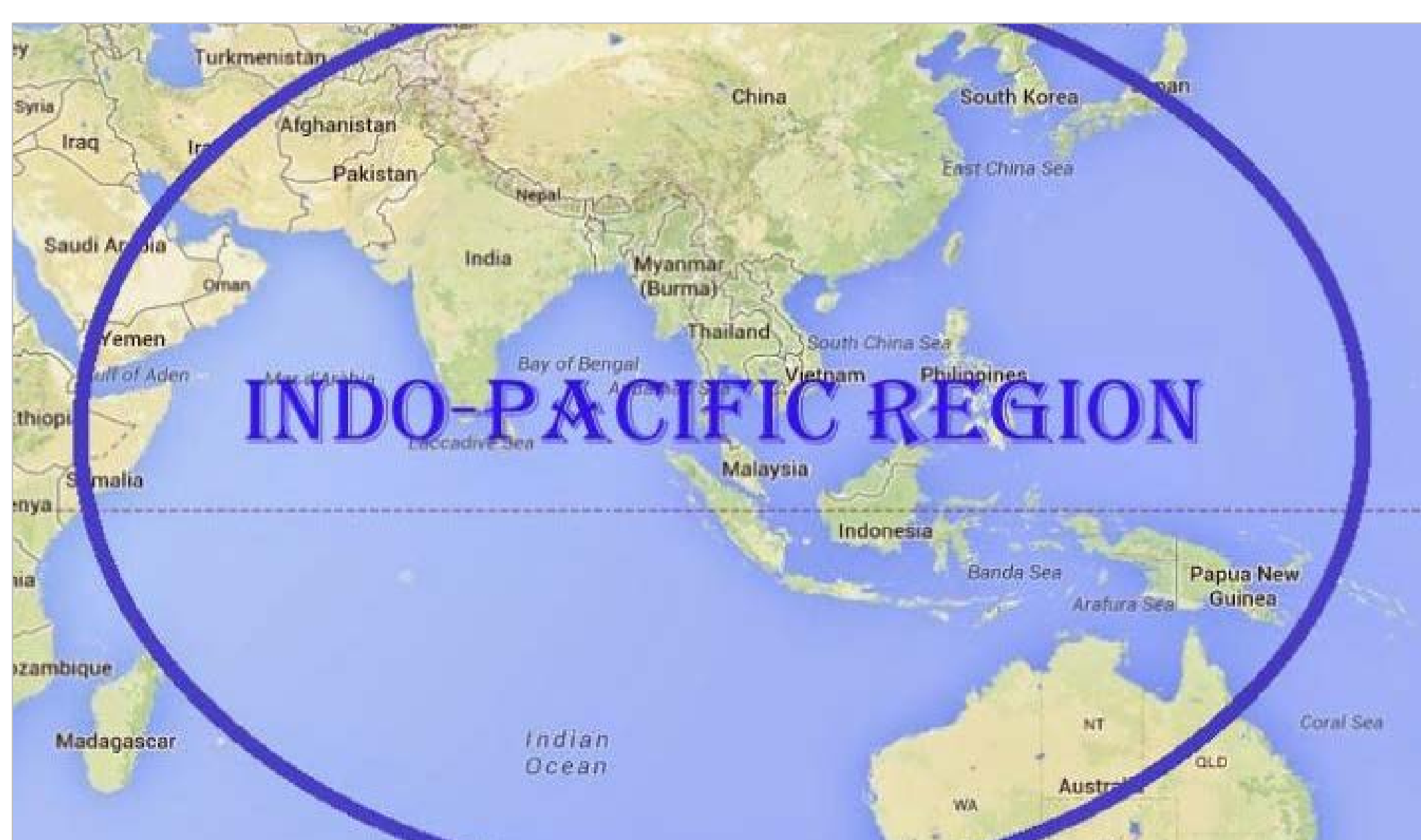
Maritime challenges in Indo-Pacific will be a focus over the rest of the century