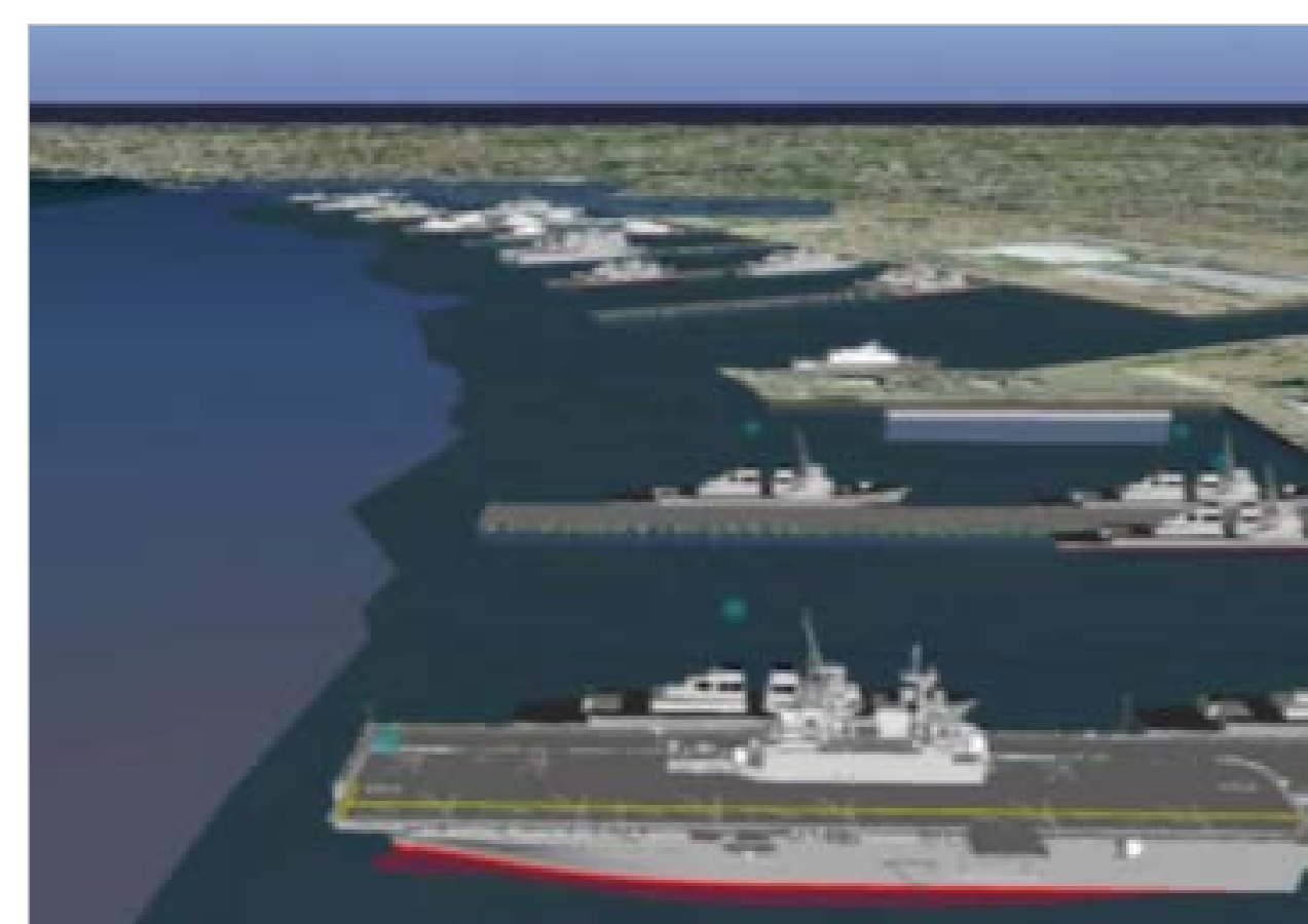
SPIDERS3D developed by NAVFAC for the Navy and Marine Corps