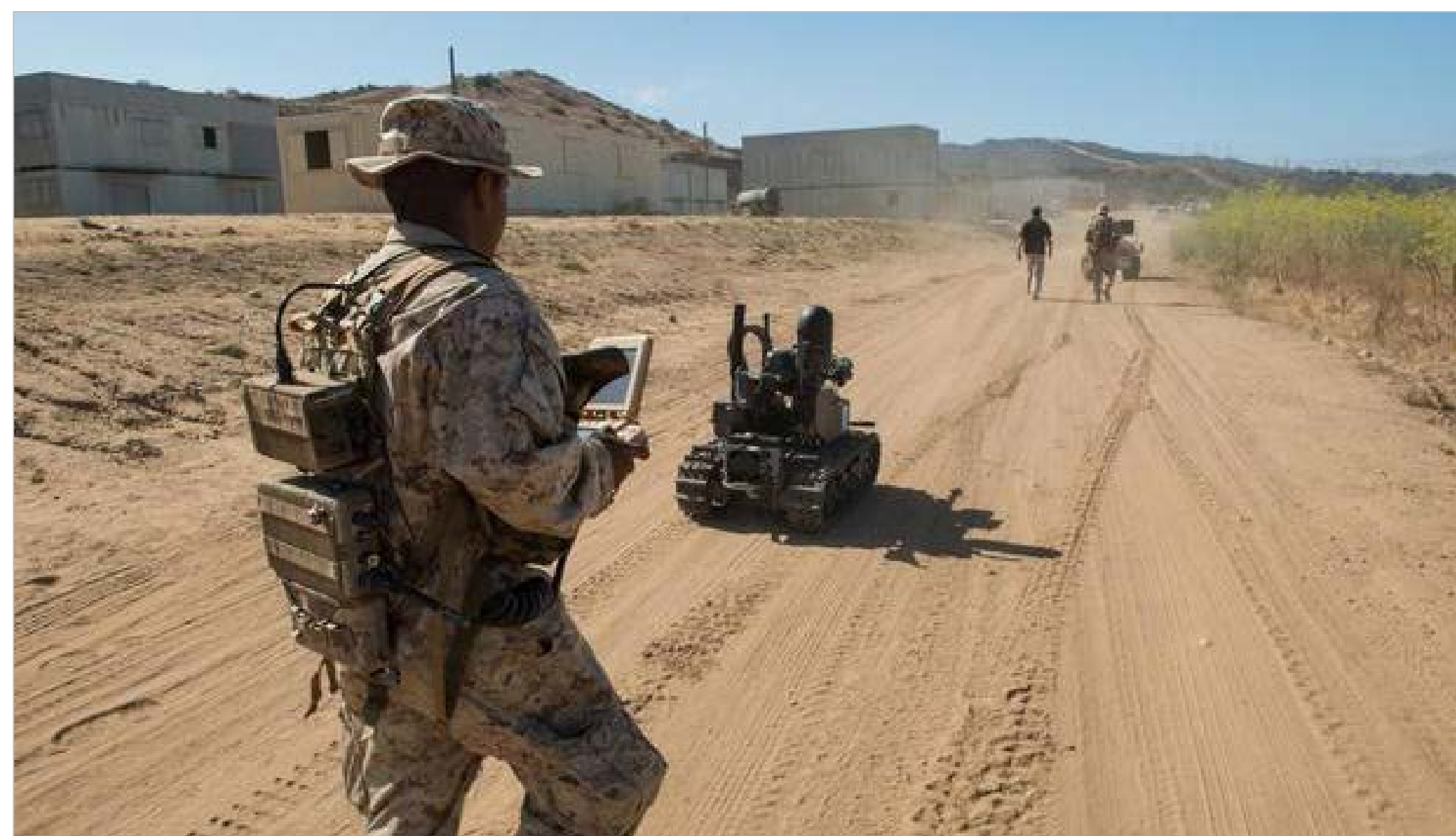
US Marines patrol with Unmanned Ground Vehicle (UGV)