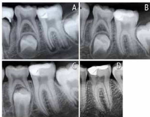
Figure 3: (a) Postoperative periapical radiograph immediately after treatment; (b) Postoperative periapical radiograph taken at the two-year recall visit. Note the continued root development and 0.5 mm dentine bridge that formed at the exposure site; (c) Postoperative periapical radiograph taken at the four-year recall visit. Note the closure of the apices of the mesial and distal roots and an increase in the thickness of the dentine bridge; (d) Postoperative periapical radiograph taken at the 14-year recall visit. The periodontal ligament around the apical third of the mesial root was still widened, and a small calcification or pulp stone formed in the pulp chamber.

ionomer material over MTA is also needed to protect the MTA during restoration placement, thereby allowing for a single-stage pulp capping procedure. 52 Without this layer of glass-ionomer, it would be necessary to place a water-moistened cotton pellet directly over the unset MTA material, and the patient would need to attend a second appointment for the definitive restoration. 52