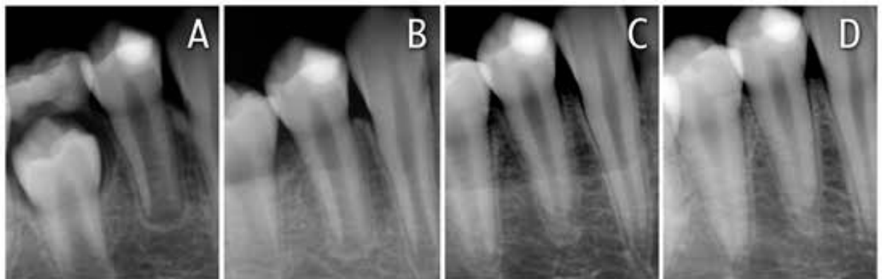
Figure 2: (a) Periapical radiograph taken at the one-year recall visit. Note the continued root development with evidence of a thin dentine bridge at the exposure site; (b) Periapical radiograph taken at the two-year recall visit. Note the continued root development; (c) Periapical radiograph taken at the three-year recall visit clearly showing complete root formation and apex closure; (d) Periapical radiograph taken at the four-year recall visit showing complete root formation with a normal periodontal ligament.