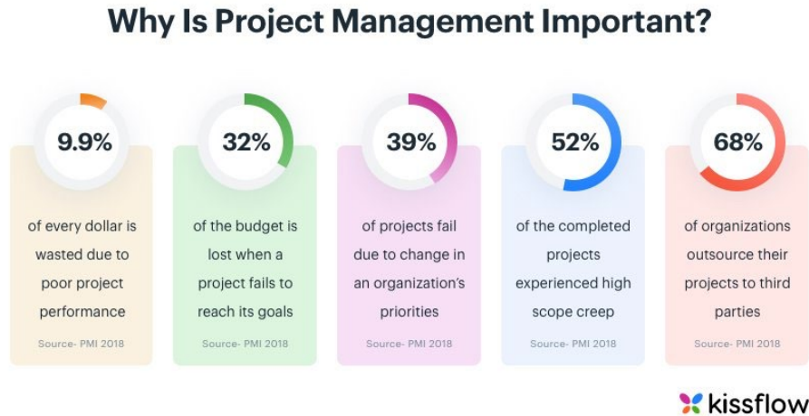
Figure 1. The importance of project management.

The following (Figure 1) is a snapshot of where some organizations spend their resources.