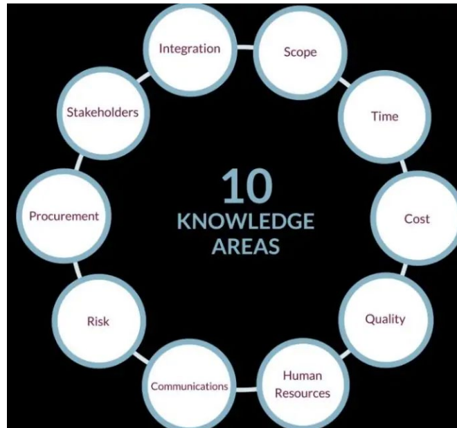
Figure 3. The major knowledge areas. Adapted from Project Manager Society (2021).