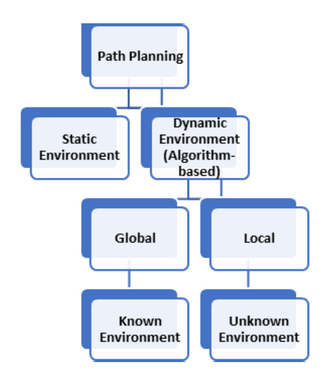
FIGURE 3. Classifications of mobile robot path planning methods [36].

Safe and efficient mobile robot navigation requests an efficient path planning technique since the quality of the generated path affects extremely the robotic applications [32]–[34]. In an environment with several obstacles, finding a path without collision with obstacles from the initial point to the final point becomes an issue such as shortness and simplicity of route are important criteria affecting the optimality of selected routes. Considering the length of the path travelled by the robot, energy consumption and its performance time, and an algorithm that finds the shortest possible route [35] is most appropriate. Basically, there are two types of environment: static and dynamic. While dynamic environment is divided into global and local path planning [33]. Global navigation strategy deals with a completely known environment while local navigation strategy deals with the unknown and partially known environment. Figure 3 shows the breakdown of path planning categories.