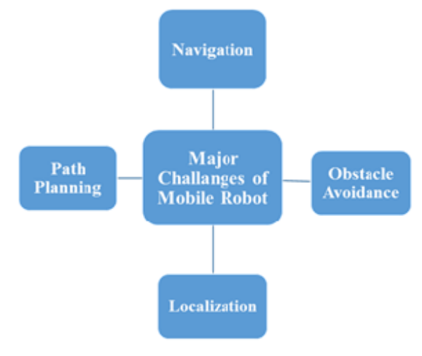
FIGURE 2. Challenges of mobile robot.

The other sections of this paper are as follows: Section 2 commences by presenting the challenges mobile robots are faced with. This is followed by sensors and technique used to determine the positioning of mobile robots such as to improve accuracy in Section 3. Section 4 discusses the different types of methods used for object recognition and feature matching. Furthermore, related work on sensor fusion techniques were presented in Section 5. Section 6 presented the classification of sensor fusion algorithms. Section 7 highlighted the importance of sensor fusion techniques while Section 8 discusses the areas where researchers can further investigate on the issues challenging mobile robot navigation and localization in both known and unknown environment and Section 9 concludes the paper.