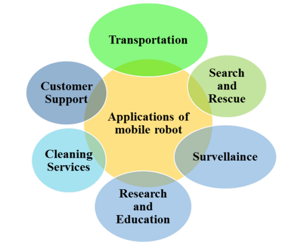
FIGURE 1. Applications of mobile robot.

Furthermore, mobile robot is gaining more interest in the area of mining industry [20]. The use of mobile robot has