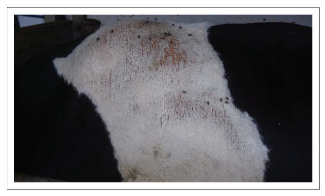
FIGURE 2 : Non-pigmented (white) skin of a Holstein cow with photosensitisation showing reddening and oozing of serum.

FIGURE 1: Teats of a cow with acute photosensitisation showing reddening, erosions and crusting.