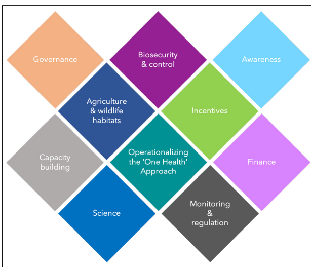
Figure 2: UNEP’s Ten science-based policy recommendations that focus on a One Health approach.

The latest UNEP report adopts ‘One Health’ as a collaborative, multisectoral and transdisciplinary approach – working at local, regional, national and global levels – to achieve optimal health and well-being outcomes, recognising the interconnections between people, animals, plants and their shared environment (Figure 2). 17 Other approaches, such as ‘Planetary Health’ 18 and ‘One Welfare’ 19 also exist; however, UNEP considered ‘One Health’ as an easily understood umbrella term.