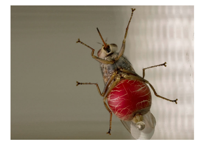
Figure 1. A recent blood-fed tsetse fly ( Glossina morsitans morsitans ) seen through the plexiglass sheet on which it is resting. Within a few minutes, the fly must rapidly excrete 80% of the water and salts from the blood-meal using a process called diuresis. A drop of excreted fluid has already fallen onto the plexiglass cage wall and is acting as a magnifying glass to accentuate the next droplet forming.

It is intriguing, therefore, that a reviewer who rejected Ellstrand's first submission of his JSS essay to another journal wrote "... it is difficult to see how any organism with a nutritionally dependent juvenile could produce a juvenile of larger mass, unless the adult acts like a nutrient pump over a long period of time, slowly inflating the ballooning infant". How ironic that this sentence, written in deep scepticism, describes the very process of prenatal juvenile development in tsetse flies, keds, and bat flies. In this essay, we focus on the causes and consequences of producing relatively large offspring in tsetse flies, as there are extensive data on their ecology and life history and because of their capacity to transmit the fatal diseases known as the African trypanosomiases.