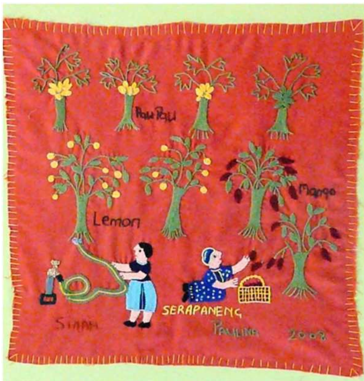
Figure 1. Sinah Matikitela & Paulina Makobela, Photograph 4.17 Serapaneng. Gathering fruit, 2008. Embroidery, Coll. Mogalakwena Ethnographic Art Archives (MEAA).