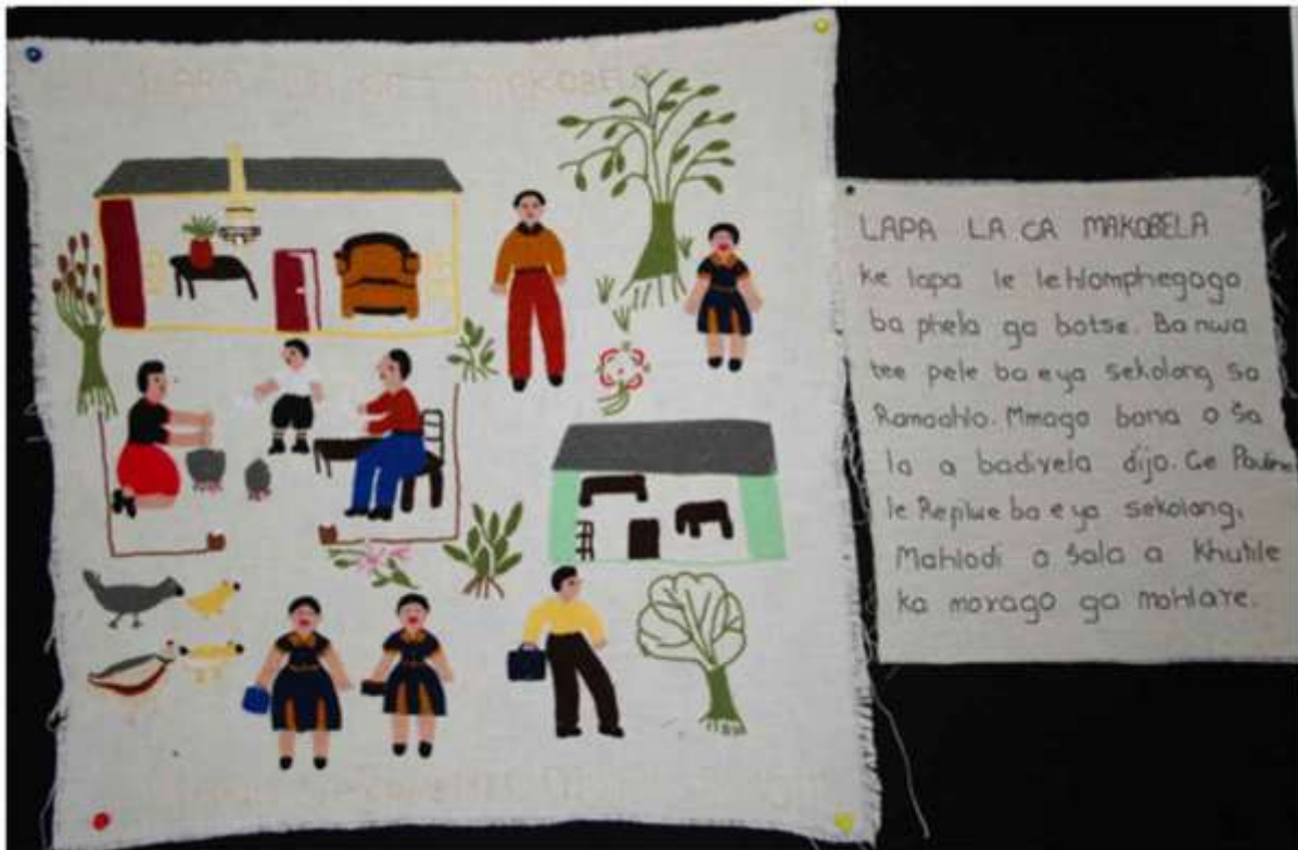
Figure 4. Sinah Matikitela, Photograph 11.16 Lapa La Ga Makobela, 2007. Embroidery, Coll. Mogalakwena Ethnographic Art Archives (MEAA).