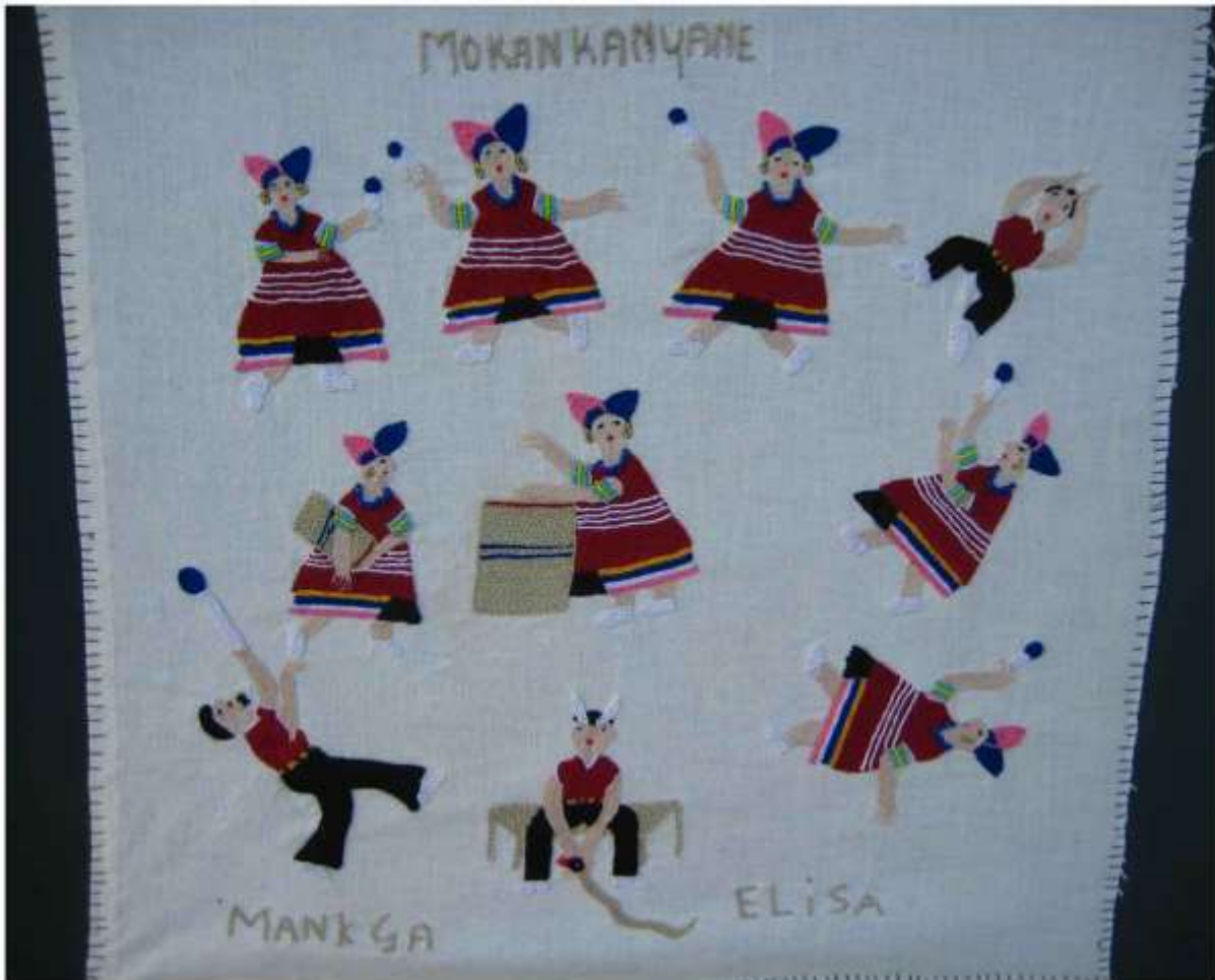
Figure 10. Elisa Mangka, Photograph 9.21 Mokankanyane, 2007. s.a. Embroidery, Coll. Mogalakwena Ethnographic Art Archives (MEAA).