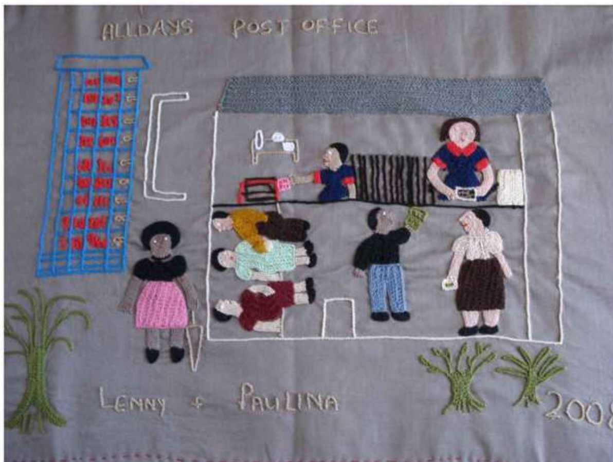
Figure 2. Paulina Makobela, Photograph 1.33 Alldays post office, 2008. Embroidery, Coll. Mogalakwena Ethnographic Art Archives (MEAA).