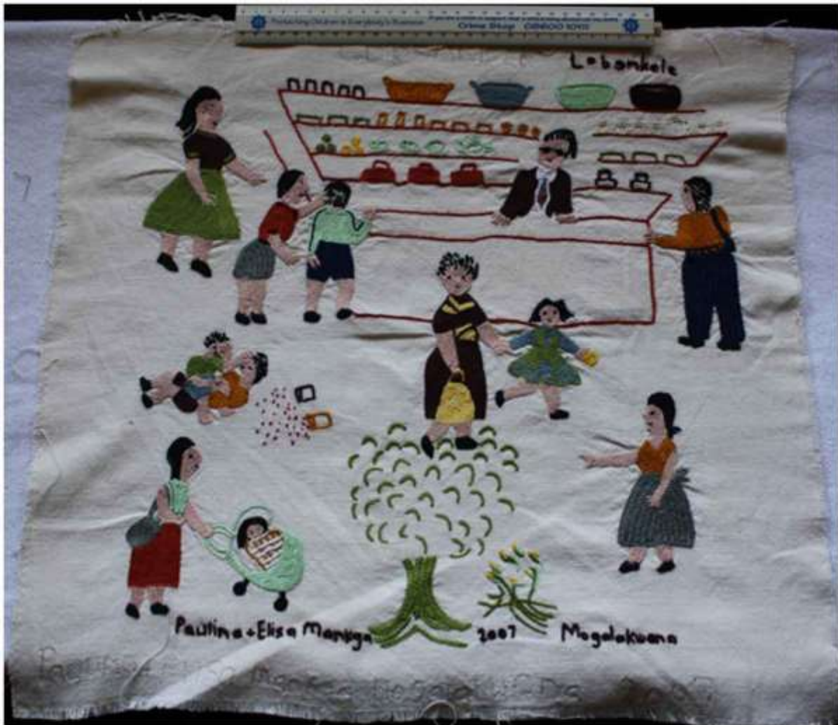
Figure 5. Paulina Makobela & Elisa Mangka, Photograph 1.18 Le benkele, 2007. Embroidery, Coll. Mogalakwena Ethnographic Art Archives (MEAA).