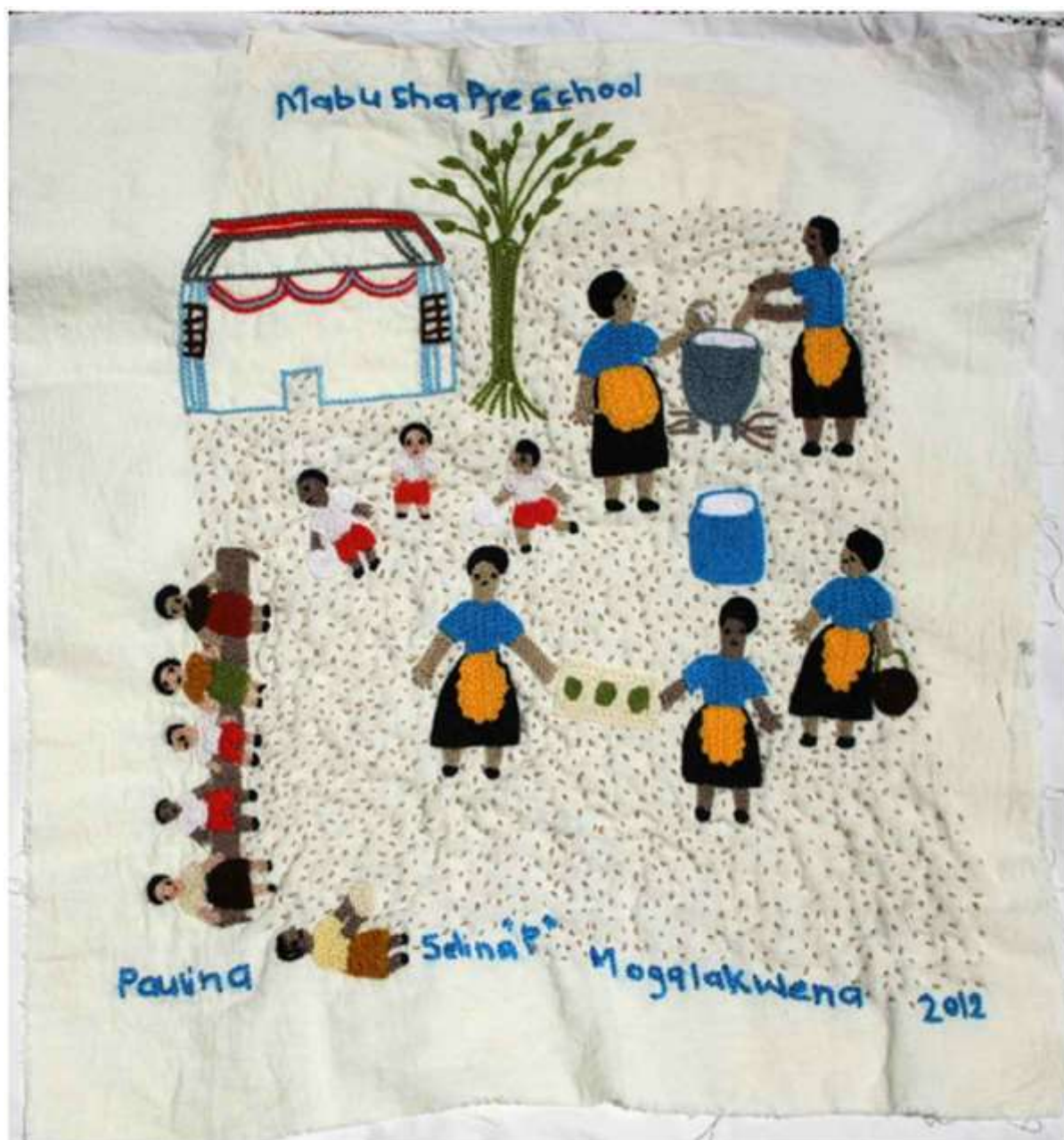
Figure 8. Paulina Makobela & Selina Phukela, Photograph 2.2 Mabusha Preschool, 2012. Embroidery, Coll. Mogalakwena Ethnographic Art Archives (MEAA).