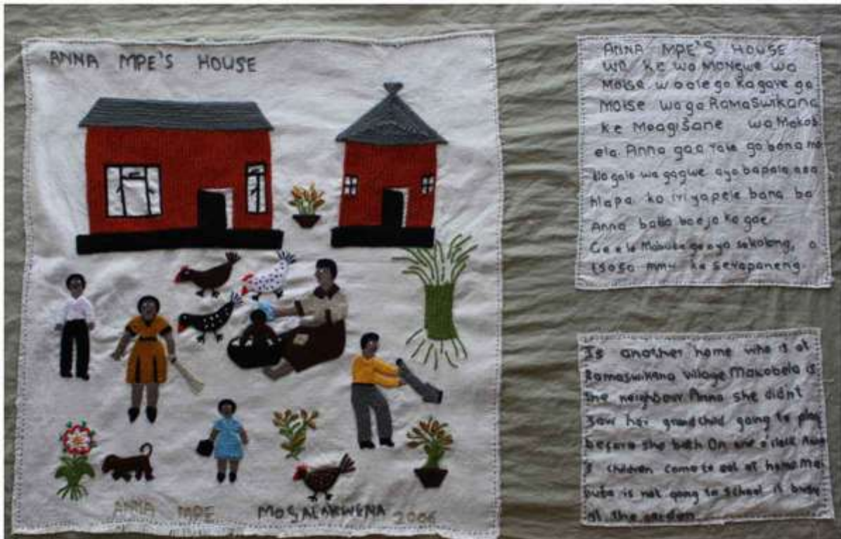
Figure 3. Anna Mphe, Photograph 11.1 Anna Mphe's House. 2006. Embroidery, Coll. Mogalakwena Ethnographic Art Archives (MEAA).