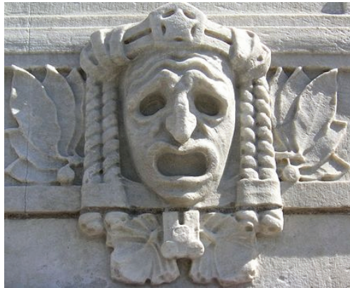
Figure 1. Tragic mask on the façade of the Royal Dramatic Theatre in Stockholm, Sweden (Wikipedia 2020: Online)

mistake (since the original Greek etymology traces back to hamartanein , a sporting term that refers to an archer or spear-thrower missing his/her target). According to Aristotle, «The misfortune is brought about not by [general] vice or depravity, but by some [particular] error or frailty. The reversal is the inevitable but unforeseen result of some action taken by the hero. It is also a misconception that this reversal can be brought about by a higher power (e.g. the law, the gods, fate, or society)” (Wikipedia 2020 Online). The eventual outcome of life events is therefore ‘unhappy’ and a loss for the sufferer, even a disfigurement of the sufferer due to personal inability to cope further. In this sense, the tragedy is not about a specific ‘choice’ but an accidental fate (Heering 1964); the disempowered person is exposed to external powers and circumstances that makes it impossible to further bounce back and to continue the human struggle for survival.