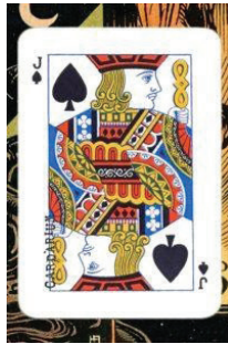
Figure 4. In Conservative British Cartomancy: A man who wishes to hurt you. Jack of Spades . [Online]. Available: https://cardarium.com/jack-of-spades-meaning-in-cartomancy-and-tarot/ [Accessed: 06/06/2020].

The experience of existential dread (the tragedy of an irreversible fate) is captured in his poet: SKOPPENSBOER ( Jack of spades ) (translation by the author).