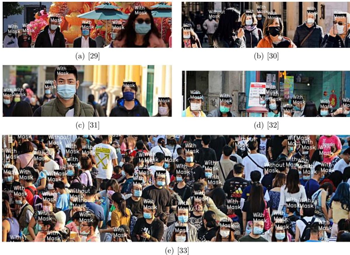
FIGURE 3. Prediction results of an image with multiple distant faces

The result shows that the trained model could correctly predict a face with a mask and without a mask, even though the face is near the camera or quite far from the camera. However, in a real-world case, the taken image consists of multiple people and with quite distant from the camera. Therefore, several tests were conducted on an image with multiple distant faces. Figures 3(a) [29], 3(b) [30], 3(c) [31], 3(d) [32], and 3(e) [33] show the result of the prediction.