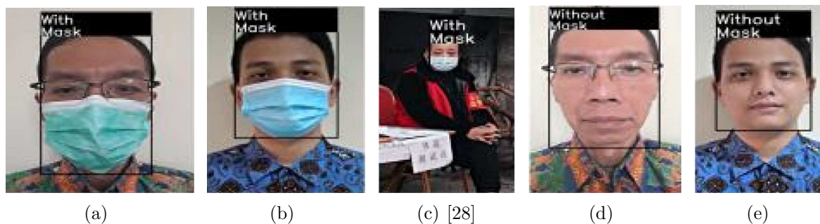
FIGURE 2. Result of detecting mask on an image with a single face

The models are then tested to detect and classify faces with a mask or without a mask. Figure 2 shows the result in which the model tried to predict a single face in an image: