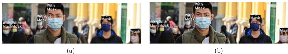
FIGURE 4. Results of (a) not applying USM sharpening and (b) applying USM sharpening