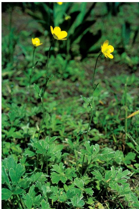
Fig. 1 Ranunculus psilostachys Griseb.

Nagyharsány: (1) the species was found in May 1962 on the south-facing near-