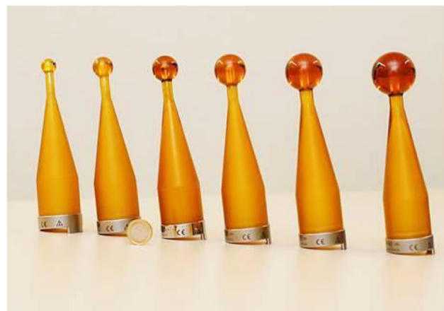
Fig. 1 According to the resection cavity, different diameters of the spherical applicator from 1.5 to 5.0 cm are available to carry out the intraoperative irradiation

After the tumor resection, the applicator size (Fig. 1) is chosen by the neurosurgeon according to the size of the resection cavity, and the spherical applicator was then gently inserted into the resection cavity. Attention is paid to avoid additional pressure of the applicator, which is covered