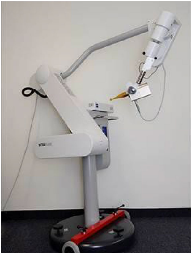
Fig. 2 After inserting the applicator sphere, intraoperative irradiation is performed with 50-kV x-rays via an INTRABEAM system

All five patients (four male, one female; mean age: 65 \pm 13.5 years) were suffering from an eloquently located solid metastasis or glioma. Before surgery, the median Karnofsky Performance Status (KPS) of the patients was 80%. Preoperatively, patients no. 1 and no. 2 suffered from intermittent speech disorders, whereas the third patient noticed behavioral changes. Patient no. 4 experienced an epileptic seizure