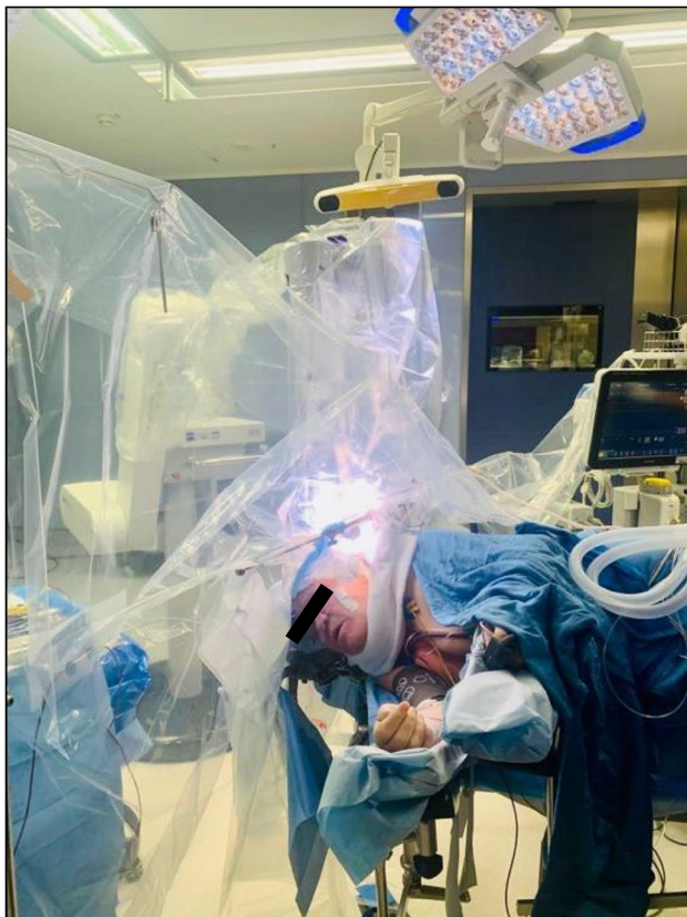
Fig. 4 IORT following metastasis resection via an asleep-awake-asleep approach in the surgery room of the University Hospital Augsburg

The anesthesiological management of asleep-awake-asleep craniotomies, in which general anesthesia or analgesedation is intermittently interrupted for neurological testing, needs specific requirements and a coordinated setting. It requires profound knowledge of neuroanesthesia including advanced airway management, to avoid complications during the procedure [13]. The anesthesiological procedures are a balancing act between overdosing anesthetics leading to impairment of respiration and alertness and underdosing directing pain, strain, and stress to the patient [12]. Pain