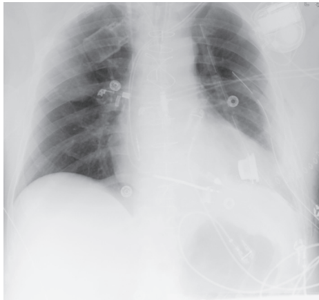
Figure 1 Chest-X-ray after the LVAD explantation with Impella 5.0 ® support. LVAD, left ventricular assist device.