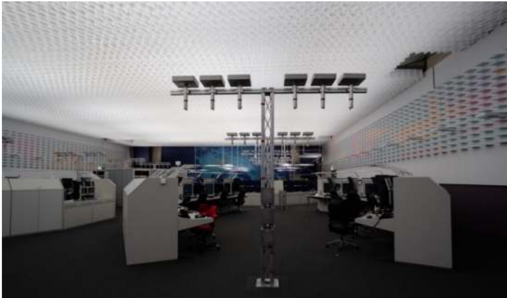
Figure 1: Light scenario during the day when workload is high

Conclusion: Integrating recommendations for healthy daytime lighting conditions with good visual conditions for computer work can be achieved by a balanced luminance distribution in the room. Besides a spectral change, the biological rhythm and psychological well-being of shift workers can be improved by additionally changing the light distribution between day and night and thus the incident light at the eye.