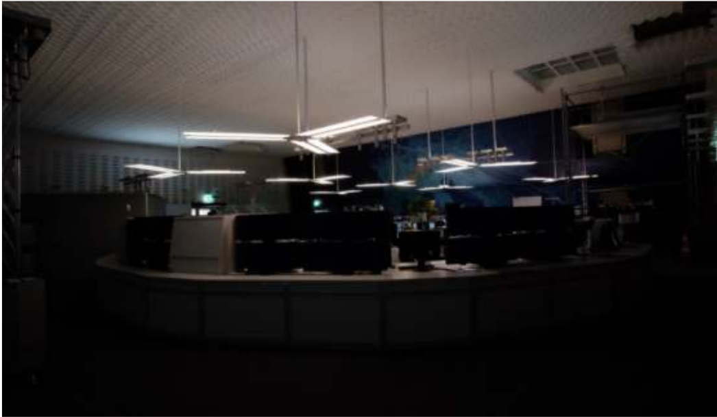
Figure 2: Light scenario during the night when workload is low A B C