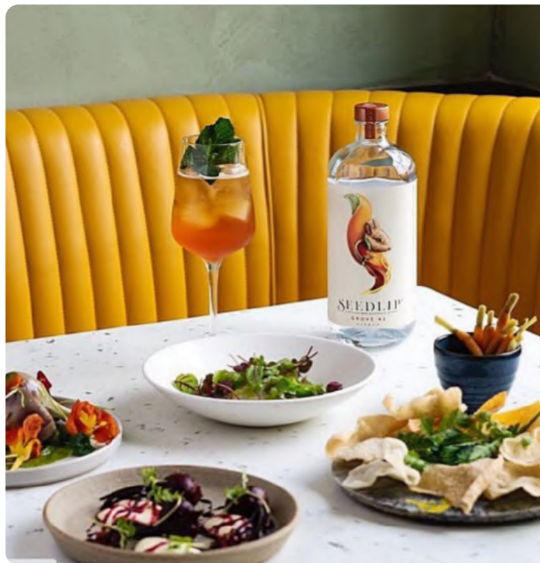
Figure 2: Image from Seedlip’s Instagram account (Seedlipdrinks 2019) promoting exclusive supper club in London, UK. https://www.instagram.com/p/Bzp79DeH74j/

Posts on social media promoted non-alcoholic pairing menus (insta1), tied in to ‘The World’s 50 Best Restaurant Awards’ (insta6) and announced Seedlip’s launch of NoLo concept bars in various global cities (insta7).