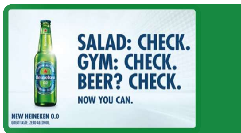
Figure 3: Now You Can Campaign Image from Heineken’s 2019 Annual Report (Heineken 2019: 13) https://www.theheinekencompany.com/sites/theheinekencompany/files/Investors/financial-information/results-reports-presentations/heineken-nv-hnv-2019-annual-report.pdf

As Vasiljevic et al. (2018a) note, NoLos may be advertised in ways that position them as a ‘healthier’ alternative to alcohol; for example promoting reduced calories as a ‘health benefit’ (Shemilt et al. 2017). Yet (Anderson et al. 2021a) suggest that evidence of the health benefits of NoLos remains scarce and argue that some research in this area has received alcohol-industry funding. There was certainly evidence that ‘health claims’ were being drawn upon in marketing by Heineken 0.0. On occasion this was explicit, for example with the widespread advertising of the product’s calorie count. At times this was more subtle, for example through implying NoLo consumption was compatible with – and could even be incorporated into – exercise regimes and sporting activities, or positioning Heineken 0.0 alongside ‘healthy’ food: