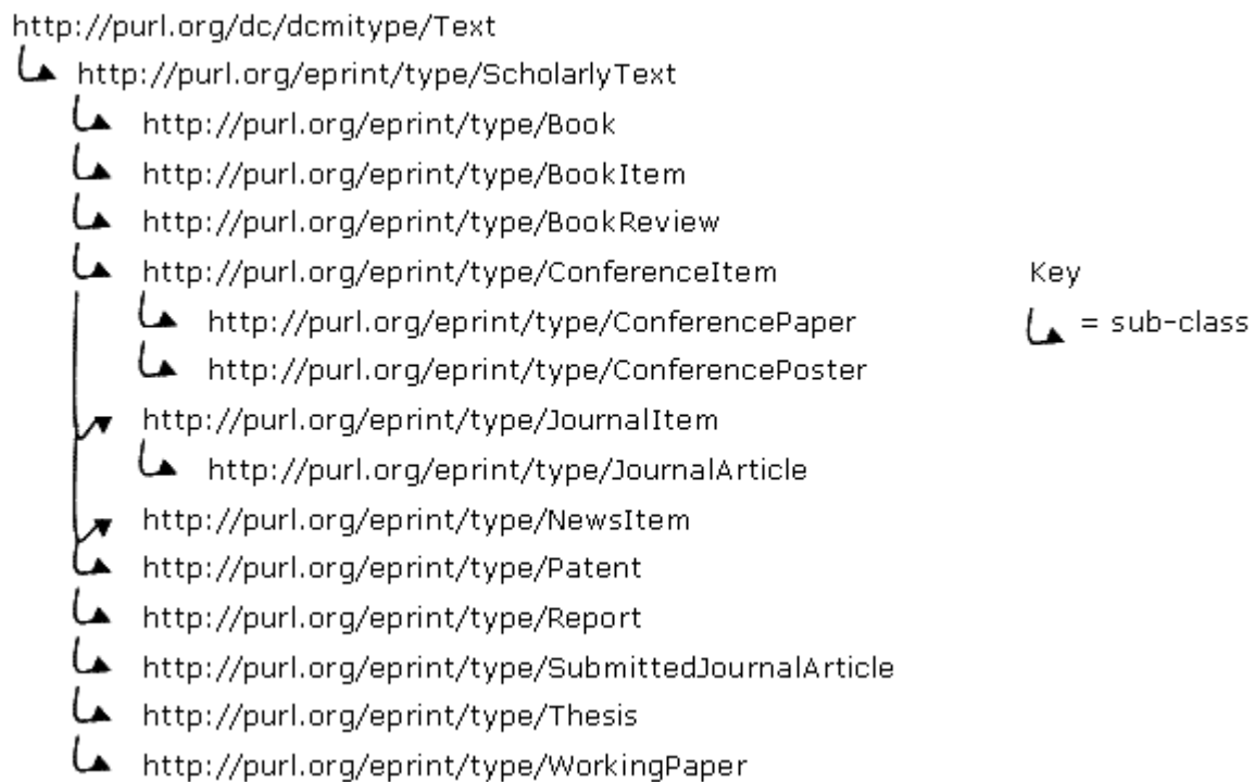
Figure 3: the eprints type vocabulary